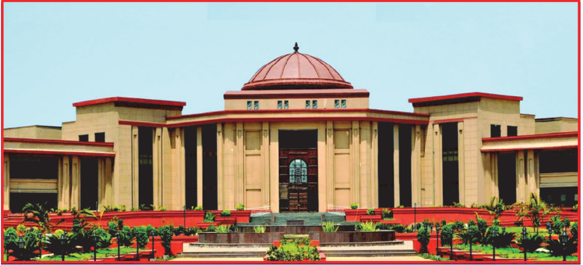
Chhattisgarh High Court, Bilaspur