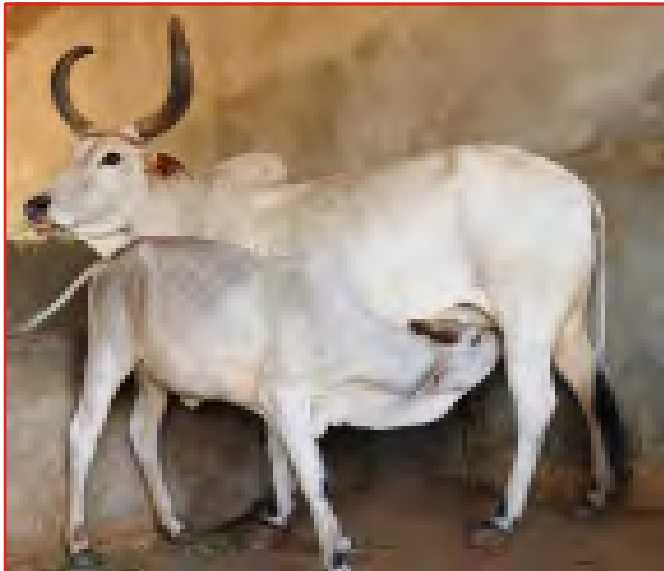
cow and calf

Those animals which do not have external ears, they do not have hair on their body and they lay eggs -