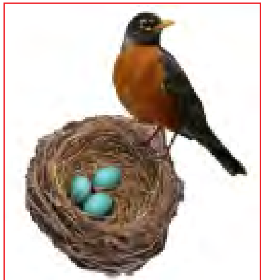
bird and eggs

Observe the birds and animals around you and see that the ears of different animals have different type of ears.