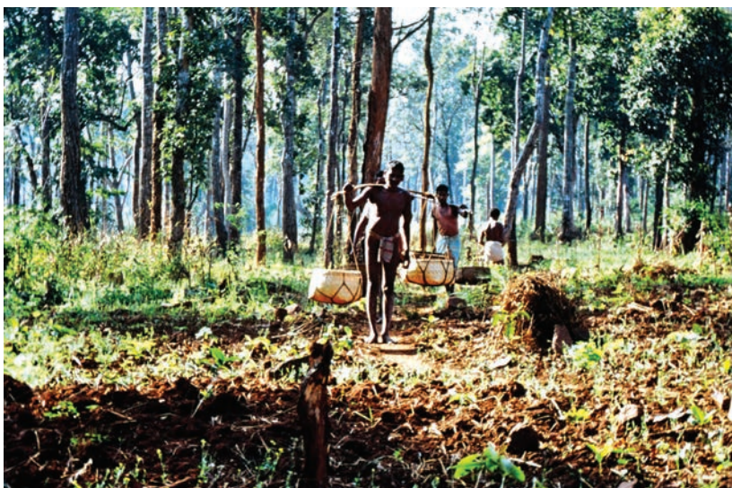
Fig. 14 – Bringing grain from the threshing grounds to the field.

The men are carrying grain in baskets from the threshing fields. Men carry the baskets slung on a pole across their shoulders, while women carry the baskets on their heads.