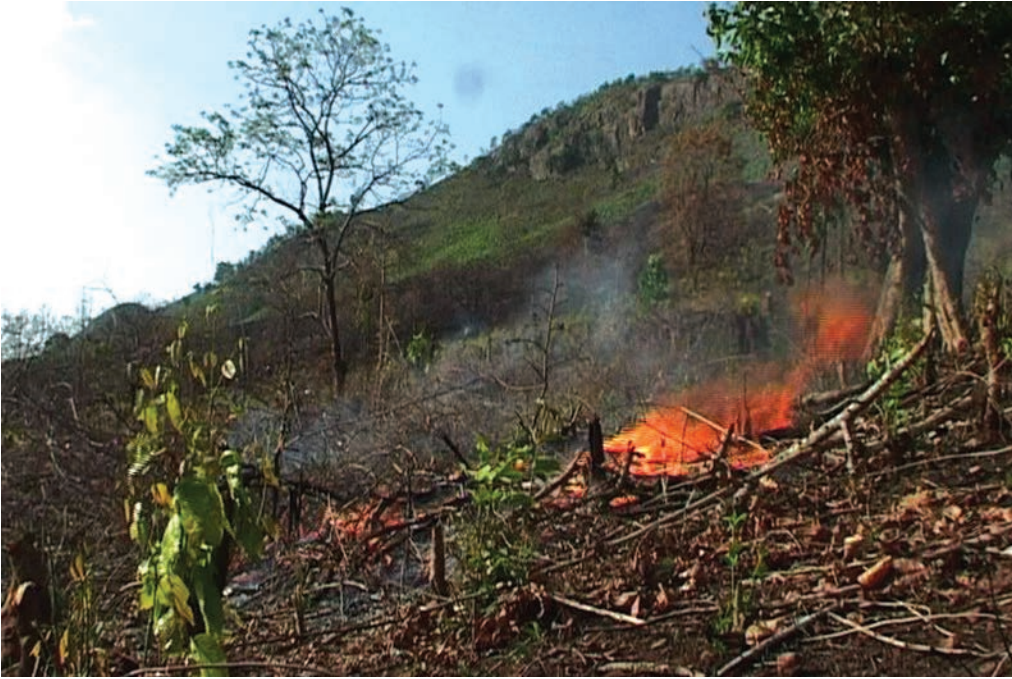
Fig. 16 – Burning the forest penda or podu plot.

In shifting cultivation, a clearing is made in the forest, usually on the slopes of hills. After the trees have been cut, they are burnt to provide ashes. The seeds are then scattered in the area, and left to be irrigated by the rain.