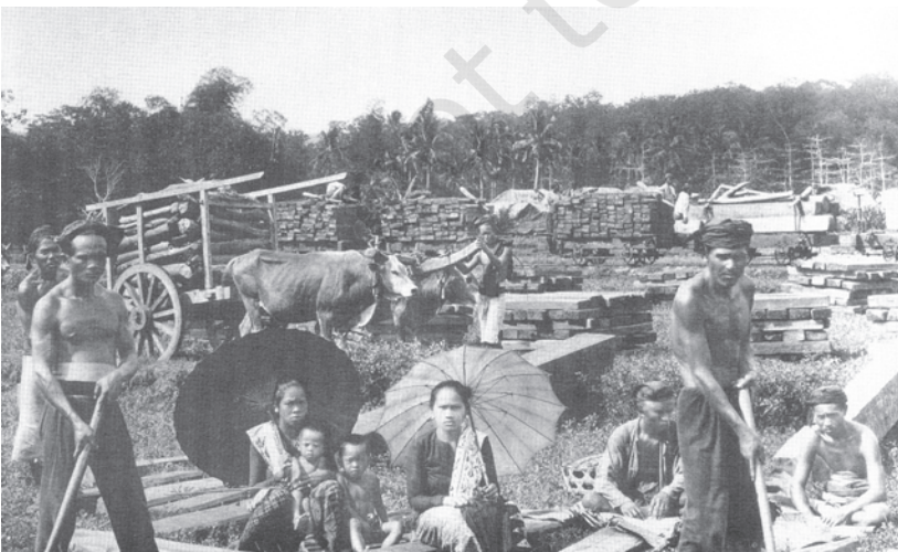
Fig.24 – Log yard in Rembang under Dutch colonial rule.

Since the 1980s, governments across Asia and Africa have begun to see that scientific forestry and the policy of keeping forest communities away from forests has resulted in many conflicts. Conservation of forests rather than collecting timber has become a more important goal. The government has recognised that in order to meet this goal, the people who live near the forests must be involved. In many cases, across India, from Mizoram to Kerala, dense forests have survived only because villages protected them in sacred groves known as sarnas , devarakudu , kan , rai , etc. Some villages have been patrolling their own forests, with each household taking it in turns, instead of leaving it to the forest guards. Local forest communities and environmentalists today are thinking of different forms of forest management.