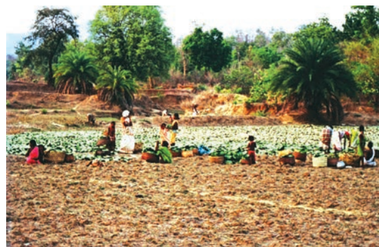
Fig. 13 – Drying tendu leaves.

The Forest Act meant severe hardship for villagers across the country. After the Act, all their everyday practices – cutting wood for their