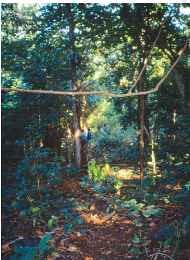
Fig. 1 – A sal forest in Chhattisgarh.

A lot of this diversity is fast disappearing. Between 1700 and 1995, the period of industrialisation, 13.9 million sq km of forest or 9.3 per cent of the world's total area was cleared for industrial uses, cultivation, pastures and fuelwood.