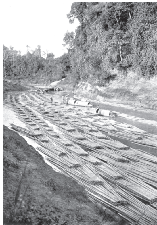
Fig.4 – Bamboo rafts being floated down the Kassalong river, Chittagong Hill Tracts.

From the 1860s, the railway network expanded rapidly. By 1890, about 25,500 km of track had been laid. In 1946, the length of the tracks had increased to over 765,000 km. As the railway tracks spread through India, a larger and larger number of trees were felled. As early as the 1850s, in the Madras Presidency alone, 35,000 trees were being cut annually for sleepers. The government gave out contracts to individuals to supply the required quantities. These contractors began cutting trees indiscriminately. Forests around the railway tracks fast started disappearing.