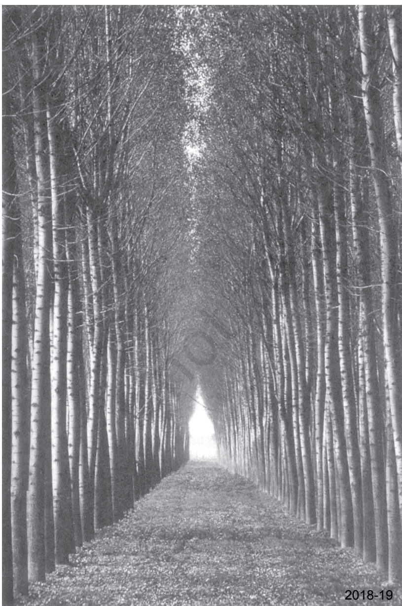
Fig.9 – One aisle of a managed poplar forest in Tuscany, Italy.

If you were the Government of India in 1862 and responsible for supplying the railways with sleepers and fuel on such a large scale, what were the steps you would have taken?