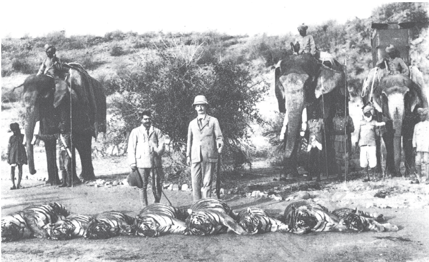
Fig. 18 – Lord Reading hunting in Nepal.

Count the dead tigers in the photo. When British colonial officials and Rajas went hunting they were accompanied by a whole retinue of servants. Usually, the tracking was done by skilled village hunters, and the Sahib simply fired the shot.