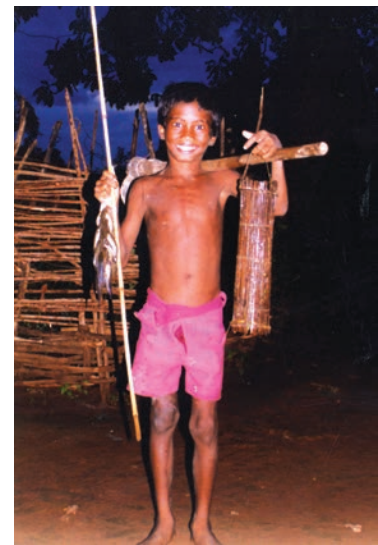
Fig. 17 – The little fisherman.

While the forest laws deprived people of their customary rights to hunt, hunting of big game became a sport. In India, hunting of tigers and other animals had been part of the culture of the court and nobility for centuries. Many Mughal paintings show princes and emperors enjoying a hunt. But under colonial rule the scale of hunting increased to such an extent that various species became almost extinct. The British saw large animals as signs of a wild, primitive and savage society. They believed that by killing dangerous animals the British