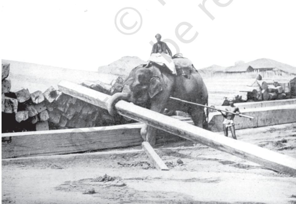
Fig.5 – Elephants piling squares of timber at a timber yard in Rangoon. In the colonial period elephants were frequently used to lift heavy timber both in the forests and at the timber yards.