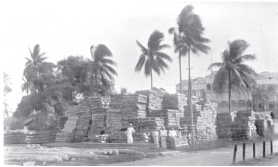
Fig.23 – Indian Munitions Board, War Timber Sleepers piled at Soolay pagoda ready for shipment, 1917.

The First World War and the Second World War had a major impact on forests. In India, working plans were abandoned at this time, and the forest department cut trees freely to meet British war needs. In Java, just before the Japanese occupied the region, the Dutch followed ‘a scorched earth’ policy, destroying sawmills, and burning huge piles of giant teak logs so that they would not fall into Japanese hands. The Japanese then exploited the forests recklessly for their own war industries, forcing forest villagers to cut down forests. Many villagers used this opportunity to expand cultivation in the forest. After the war, it was difficult for the Indonesian forest service to get this land back. As in India, people’s need for agricultural land has brought them into conflict with the forest department’s desire to control the land and exclude people from it.