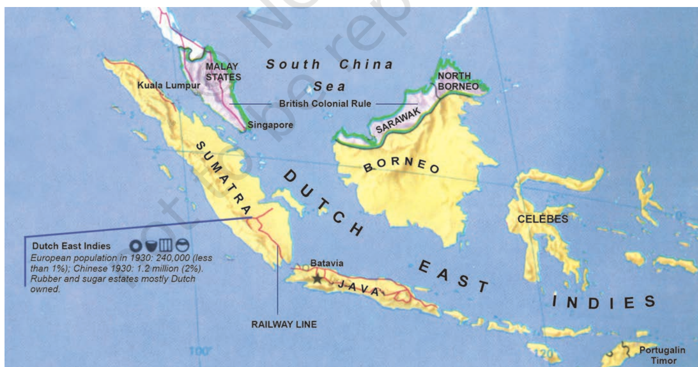
Fig. 22 – Most of Indonesia's forests are located in islands like Sumatra, Kalimantan and West Irian. However, Java is where the Dutch began their 'scientific forestry'. The island, which is now famous for rice production, was once richly covered with teak.

Dirk van Hogendorp, cited in Peluso, Rich Forests, Poor People , 1992.