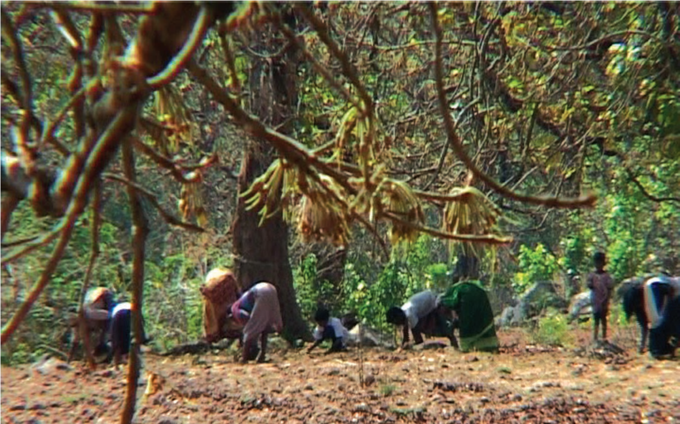
Fig. 12 – Collecting mahua ( Madhuca indica ) from the forests.

Villagers wake up before dawn and go to the forest to collect the mahua flowers which have fallen on the forest floor. Mahua trees are precious. Mahua flowers can be eaten or used to make alcohol. The seeds can be used to make oil.