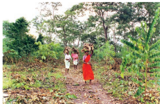
Fig.6 - Women returning home after collecting fuelwood.