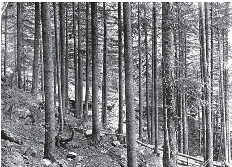
Fig. 10 – A deodar plantation in Kangra, 1933.

punished. So Brandis set up the Indian Forest Service in 1864 and helped formulate the Indian Forest Act of 1865. The Imperial Forest Research Institute was set up at Dehradun in 1906. The system they taught here was called ‘scientific forestry’ . Many people now, including ecologists, feel that this system is not scientific at all.