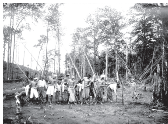
Fig. 15 – Taungya cultivation was a system in which local farmers were allowed to cultivate temporarily within a plantation. In this photo taken in Tharrawaddy division in Burma in 1921 the cultivators are sowing paddy. The men make holes in the soil using long bamboo poles with iron tips. The women sow paddy in each hole.

Children living around forest areas can often identify hundreds of species of trees and plants. How many species of trees can you name?