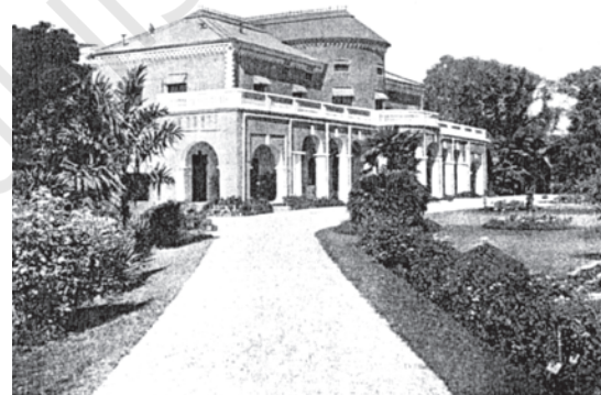
Fig. 11 – The Imperial Forest School, Dehra Dun, India. The first forestry school to be inaugurated in the British Empire.

Foresters and villagers had very different ideas of what a good forest should look like. Villagers wanted forests with a mixture of species to satisfy different needs – fuel, fodder, leaves. The forest department on the other hand wanted trees which were suitable for building