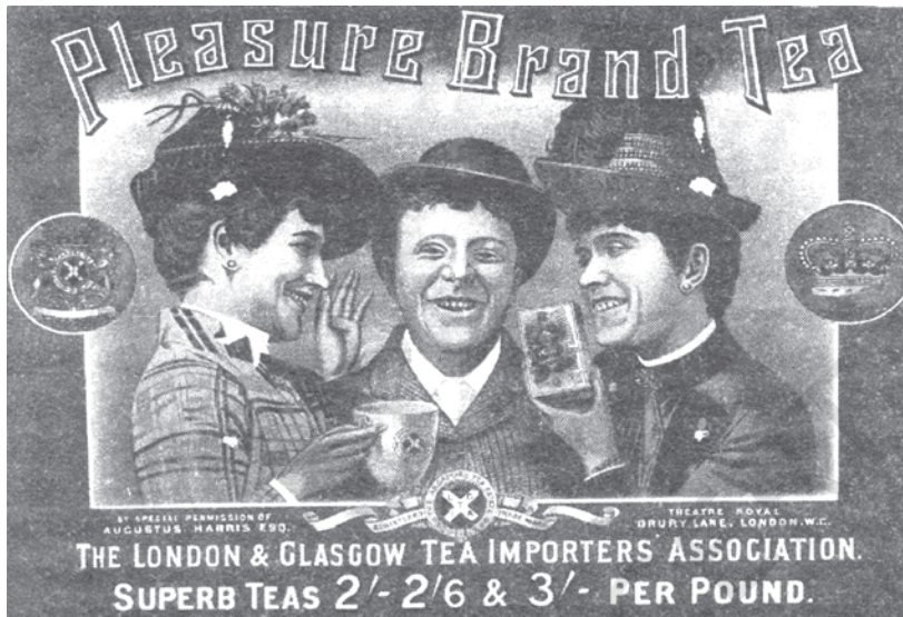
Fig.8 – Pleasure Brand Tea.

Large areas of natural forests were also cleared to make way for tea, coffee and rubber plantations to meet Europe's growing need for these commodities. The colonial government took over the forests, and gave vast areas to European planters at cheap rates. These areas were enclosed and cleared of forests, and planted with tea or coffee.