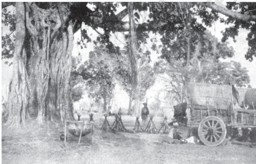
Fig. 19 – Army camp in Bastar, 1910.

Bastar is located in the southernmost part of Chhattisgarh and borders Andhra Pradesh, Orissa and Maharashtra. The central part of Bastar is on a plateau. To the north of this plateau is the Chhattisgarh plain and to its south is the Godavari plain. The river Indrawati winds across Bastar east to west. A number of different communities live in Bastar such as Maria and Muria Gonds, Dhurwas, Bhatras and Halbas. They speak different languages but share common customs and beliefs. The people of Bastar believe that each village was given its land by the Earth, and in return, they look after