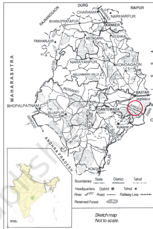
Fig.20 – Bastar in 2000.

This photograph of an army camp was taken in Bastar in 1910. The army moved with tents, cooks and soldiers. Here a sepoy is guarding the camp against rebels.