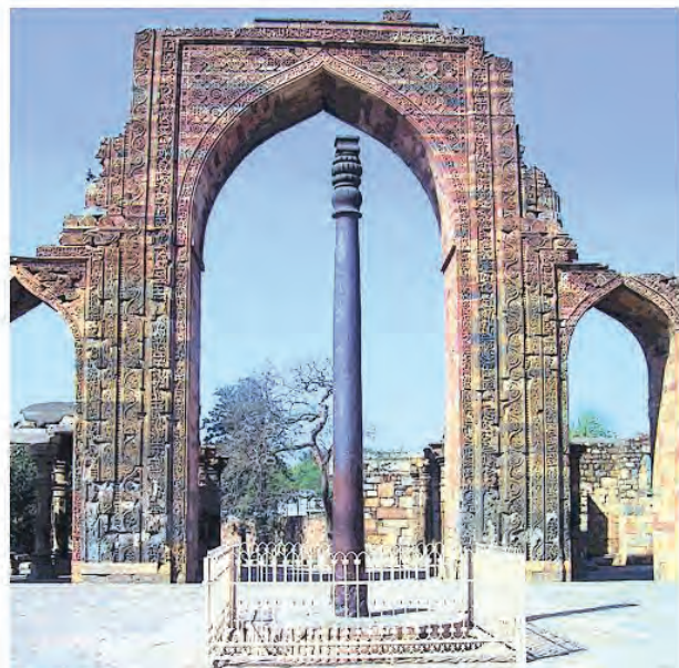
The iron pillar at Mehrauli