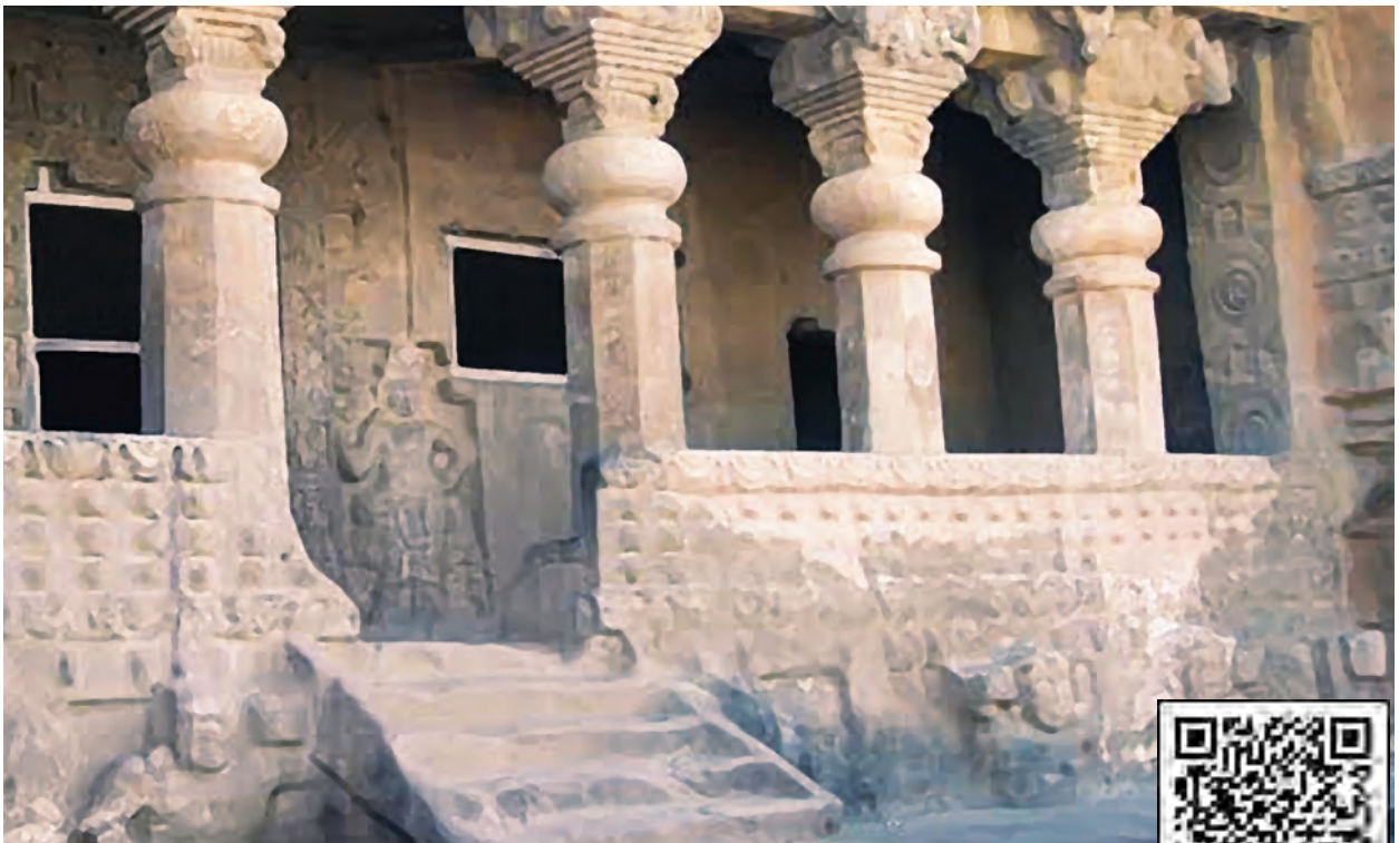
The caves at Nashik