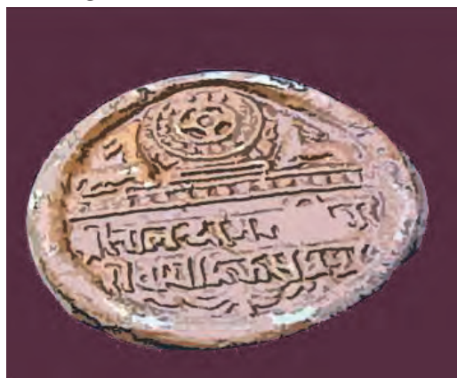
The seal of the Nalanda Mahavihara

Nalanda University : The remains of the ancient Nalanda University can be found near today's Patna city in Bihar. Emperor Harshavardhan made generous donations to this university. According to the descriptions of Yuan Chwang and Itsing, Nalanda University could accommodate thousands of students. The library stocked thousands of books. Students seeking admission to the university had to appear for an examination at the entrance gate.