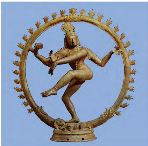
Bronze statue of Nataraj

Thus, it is clear that ancient Indian culture was very prosperous and advanced. In the next chapter, we will study India's contact with other civilisations and its far-reaching impact.