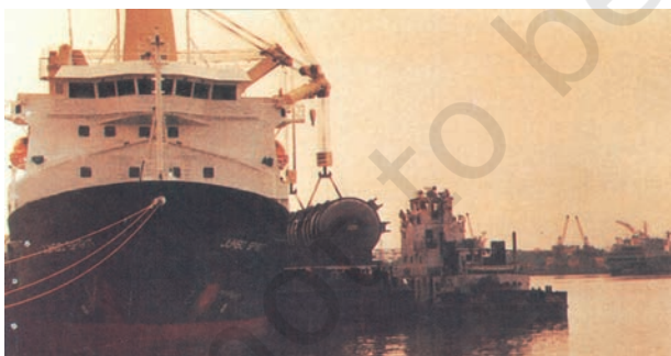
Fig. 7.8: Handling of oversize cargo at Tuticorin port

Moving along the east coast, you would see the extreme south-eastern port of Tuticorin, in Tamil Nadu. This port has a natural harbour and rich hinterland. Thus, it has a flourishing trade handling of a large variety of cargoes to even our neighbouring countries like Sri Lanka, Maldives, etc. and the coastal regions of India. Chennai is one of the oldest artificial ports of the country. It is ranked next to Mumbai in terms of the volume of trade and cargo. Vishakhapatnam is the deepest landlocked and well-protected port. This port was, originally, conceived as an outlet for iron ore exports. Paradwip port located in Odisha, specialises in the export of iron ore. Kolkata is an inland