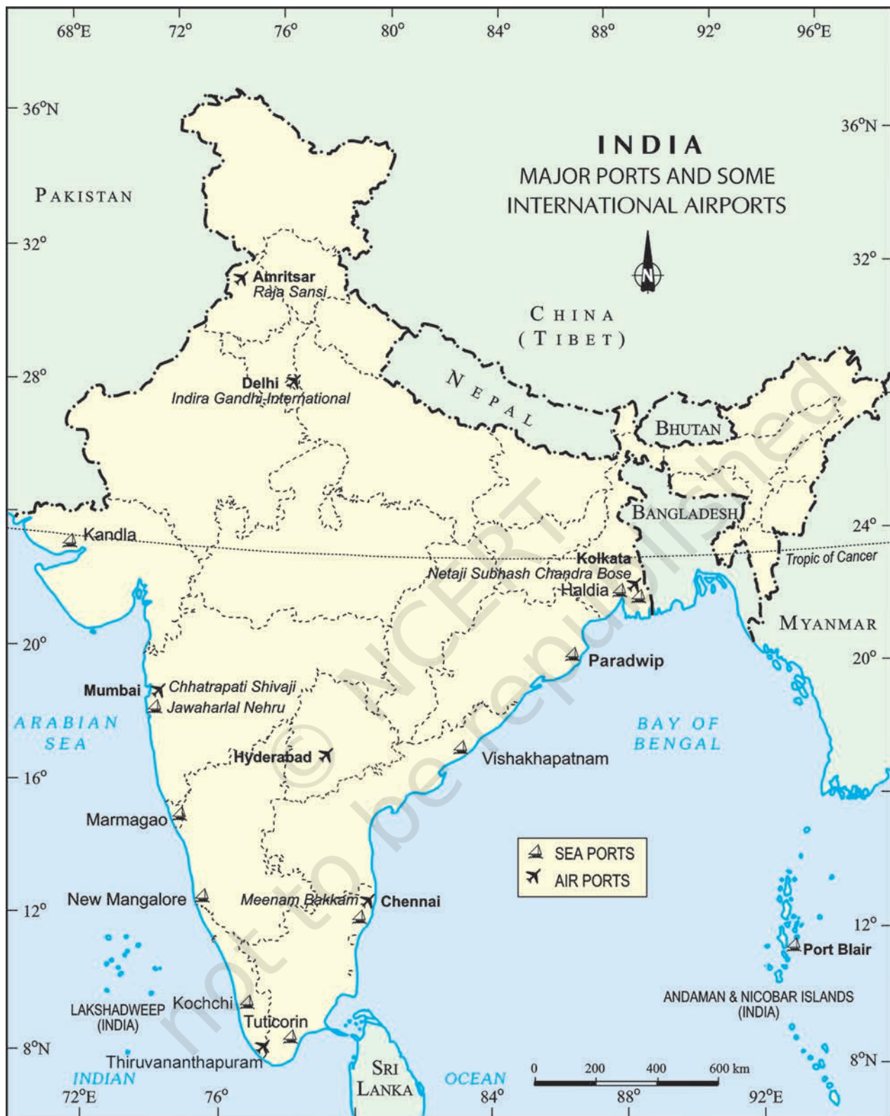
India: Major Ports and Some International Airports