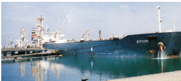
Fig. 7.7: Tanker discharging crude oil at New Mangalore port

is the premier iron ore exporting port of the country. This port accounts for about fifty per cent of India's iron ore export. New Mangalore port, located in Karnataka caters to the export of iron ore concentrates from Kudremukh mines. Kochchi is the extreme south-western port, located at the entrance of a lagoon with a natural harbour.