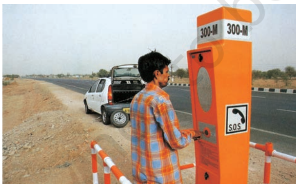
Fig.7.10 : Emergency call box on NH-8

Digital India is an umbrella programme to prepare India for a knowledge based transformation. The focus of Digital India Programme is on being transformative to realise – IT (Indian Talent) + IT (Information Technology)=IT (India Tomorrow) and is on making technology central to enabling change.