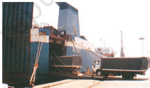
Fig. 7.6: Trucks being driven into the vessel at Mumbai port

Kandla in Kuchchh was the first port developed soon after Independence to ease the volume of trade on the Mumbai port, in the wake of loss of Karachi port to Pakistan after the Partition. Kandla is a tidal port. It caters to the convenient handling of exports and imports of highly productive granary and industrial belt