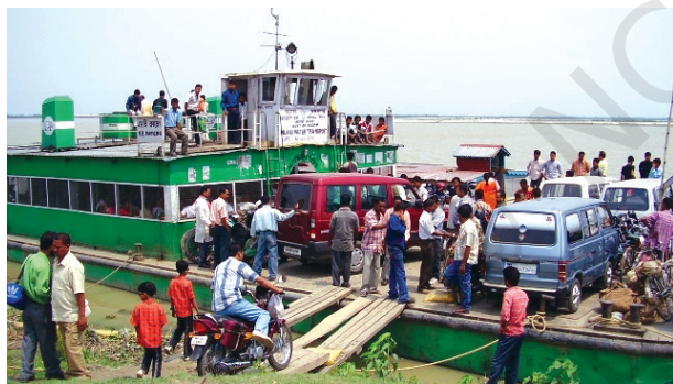
Fig. 7.5: Inland waterways widely used in north-eastern states

Since the ancient period, India was one of the seafaring countries. Its seamen sailed far and near, thus, carrying and spreading Indian commerce and culture. Waterways are the cheapest means of transport. They are most suitable for carrying heavy and bulky goods. It is a fuel-efficient and environment friendly mode of transport. India has inland navigation waterways of 14,500 km in length. Out of these only 5685 km are navigable by mechanised vessels. The following waterways have been declared as the National Waterways by the Government.