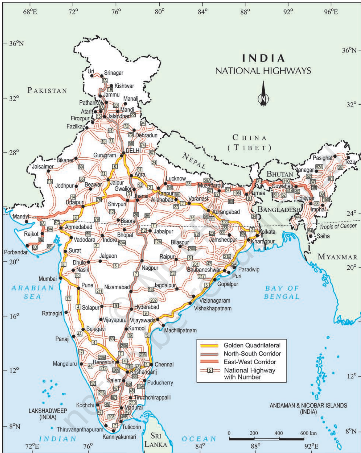
India: National Highways