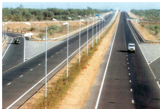
Fig.7.2: Ahmedabad- Vadodara Expressway

Shah Suri Marg is called National Highway No.1, between Delhi and Amritsar.