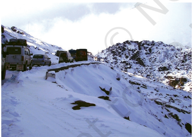
Fig. 7.4: Traffic on north-eastern border road (Arunachal Pradesh)

Roads can also be classified on the basis of the type of material used for their construction such as metalled and unmetalled roads. Metalled roads may be made of cement, concrete or even bitumen of coal, therefore,