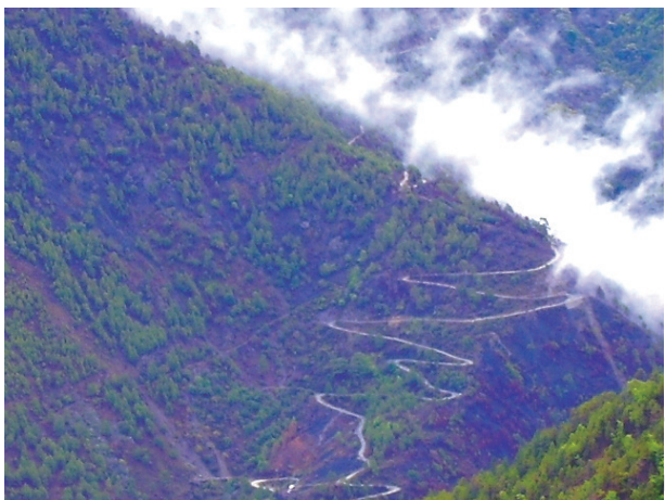
Fig. 7.3: Hilly Tracts