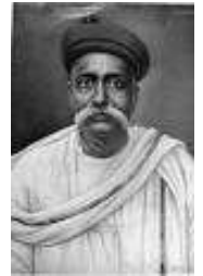
Tilak was deported to Mandalay jail in Myanmar for his writings in Kesari .