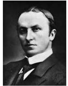
Lord Curzon partitioned Bengal into West and East Bengal.

What was most disturbing was that while West Bengal had Hindus in majority, East Bengal had Muslims in majority. It was an attempt by the British to divide Bengal on communal lines.