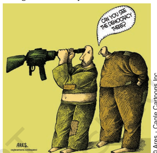
Seeing the democracy