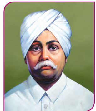
Lala Lajpat Rai

There was lathi charge on the demonstrators. At Lahore, Lala Lajpat Rai was leading the demonstration against the Simon Commission. The police lathi charged the demonstrators. Saunders, a police officer, attacked Lalaji with a lathi. After the attack, in a protest meeting, Lalaji said, "Every blow on my body will prove a nail in the coffin of the British Empire". Within few days of the attack Lalaji died.