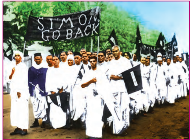
Simon Go Back

In 1928, the commission arrived in India. Wherever it travelled, the people made demonstrations against them, by