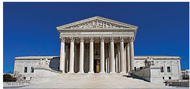
Supreme Court of the United States of America

But why does the Judiciary have this power? Both the Executive and the Legislature are involved in the process of law-making. It would be highly inappropriate to give them the power to examine whether the laws that they have made are consistent with the Constitution or not. It is likely that they would be biased while doing so. The Judiciary is not involved in any way in the law-making process. It is an independent body. Hence it has been assigned this power.