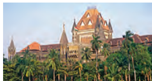
High Court (One for every State)