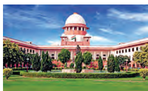
Supreme Court (One for all)

The structure of the judicial system is also broadly laid down by the Constitution. The Supreme Court of India headed by the Chief Justice of India is the highest court of the land. The next level consists of the High Courts, whose head is also known as the Chief Justice. Generally, there is one High Court for each State, but in exceptional circumstances, one or more States may have single High Court to them. These courts and their judges enjoy constitutional protection. Below the High Courts are the District Courts for each district. At the lowest level are courts which deal with petty offences. Those who are not satisfied with the decisions of a court can appeal to a higher court to ask for a reconsideration of the decision. The High Court controls and supervises the functioning of the District Courts and the other courts. In larger cities, there are Family Courts which deal with family matters.