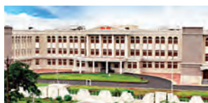
District Court (One for every District)

The Constitution lays down the procedure for the appointment of the judges of the Supreme Court and the High Courts. They are formally appointed by the President in consultation with the