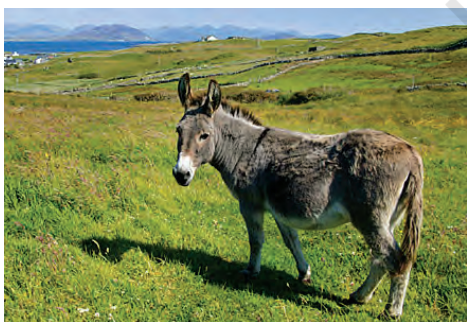
Figure 9.2 Mule

Interspecific hybridisation: In this method, male and female animals of two different related species are mated. In some cases, the progeny may combine desirable features of both the parents, and may be of considerable economic value, e.g., the mule (Figure 9.2). Do you know what cross leads to the production of the mule?