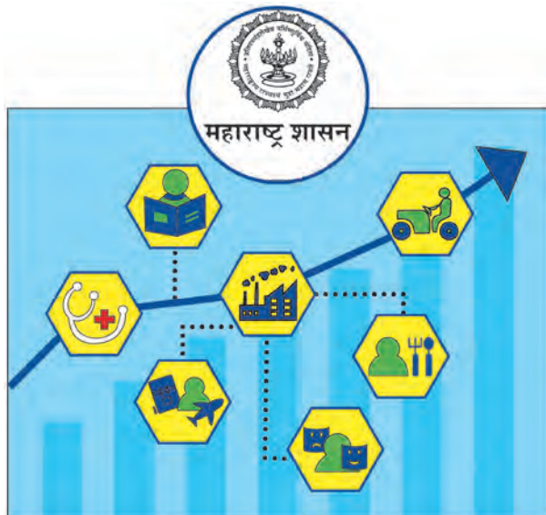
Fig. 4.1 : Economy of Maharashtra

A) Agricultural sector : Agriculture and allied activities play an important role in the economic development of the state. As per Economic Survey of Maharashtra 2017-18, the share of agriculture and allied activities in the total Gross State Value Added (GSVA) was 12.2% during 2016-17 as against 15.3% during 2001-02 which shows a declining trend over the period.