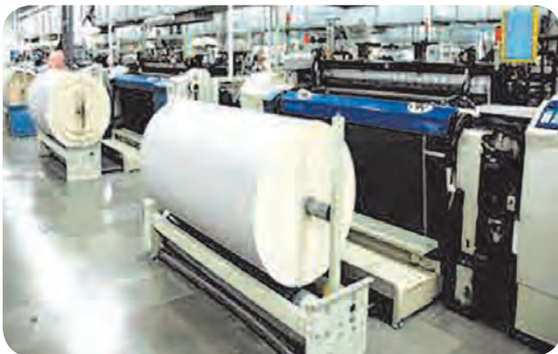
Fig. 4.3 : Industry

major role in the economic development of Maharashtra. It has the potential to absorb excess labour from the farming sector,. It leads to diversification of markets, generates higher incomes and higher productivity. As per Annual Survey of Industries (ASI) 2016-17, the industrial sector of Maharashtra is at the top position. The share of industry in the Net Value Added (NVA) is about 18%. Maharashtra has also been the first choice of domestic and foreign investors.