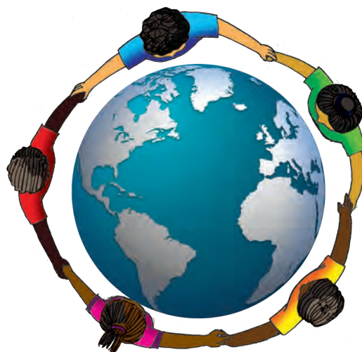
Fig. 4.4 : Co-operative Movement

Co-operative movement is the greatest contribution given by the state of Maharashtra to the country.