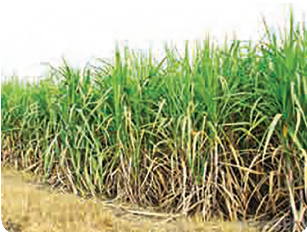
Fig. 4.2 : Agriculture

A) Agricultural sector : Agriculture and allied activities play an important role in the economic development of the state. As per Economic Survey of Maharashtra 2017-18, the share of agriculture and allied activities in the total Gross State Value Added (GSVA) was 12.2% during 2016-17 as against 15.3% during 2001-02 which shows a declining trend over the period.