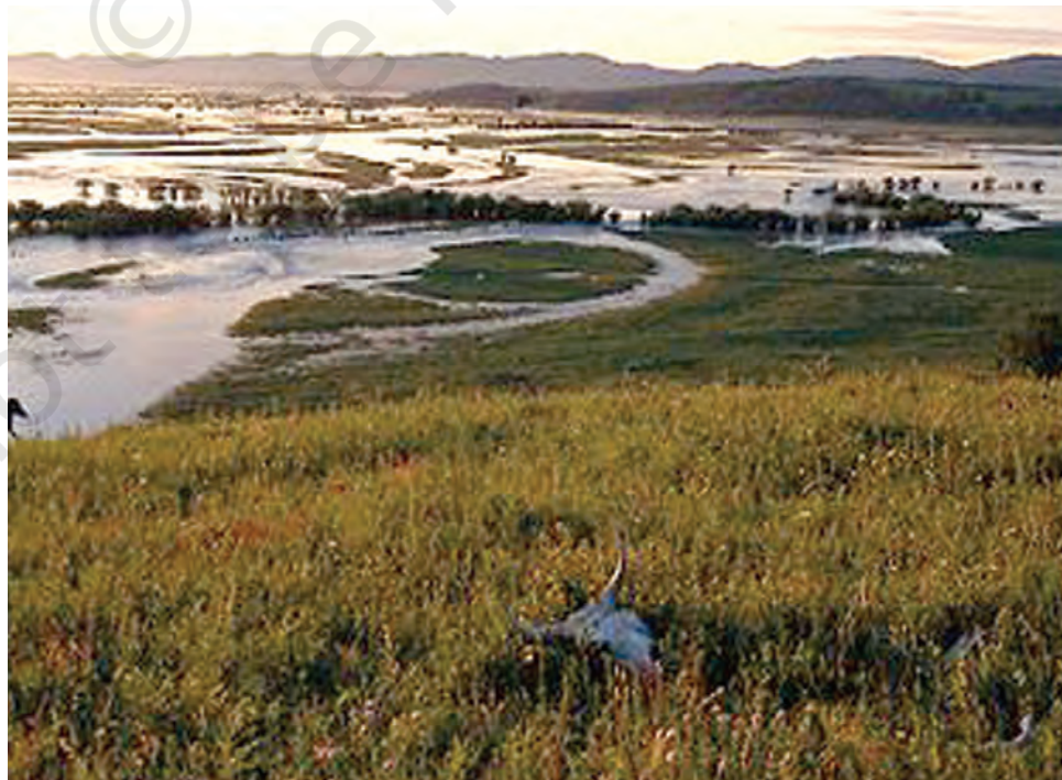
Onon river plain in flood.

The Mongols were a diverse body of people, linked by similarities of language to the Tatars, Khitan and Manchus to the east, and the Turkic tribes to the west. Some of the Mongols were pastoralists while others were hunter-gatherers. The pastoralists tended horses, sheep and, to a lesser extent, cattle, goats and camels. They nomadised in the steppes of Central Asia in a tract of land in the area of the modern state of Mongolia. This was (and still is) a majestic landscape with wide horizons, rolling plains, ringed by the snow-capped Altai mountains to the west, the arid Gobi desert in the south and drained by the Onon and Selenga rivers and myriad springs from the melting snows of the hills in the north and the west. Lush, luxuriant grasses for pasture and considerable small game were available in a good season. The hunter-gatherers resided to the north of the