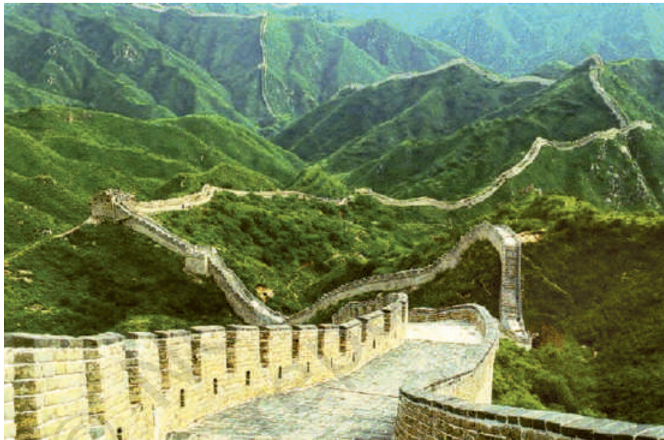
The Great Wall of China.

marginal losses. Throughout its history, China suffered extensively from nomad intrusion and different regimes – even as early as the eighth century BCE – built fortifications to protect their subjects. Starting from the third century BCE, these fortifications started to be integrated into a common defensive outwork known today as the ‘Great Wall of China’ a dramatic visual testament to the disturbance and fear perpetrated by nomadic raids on the agrarian societies of north China.