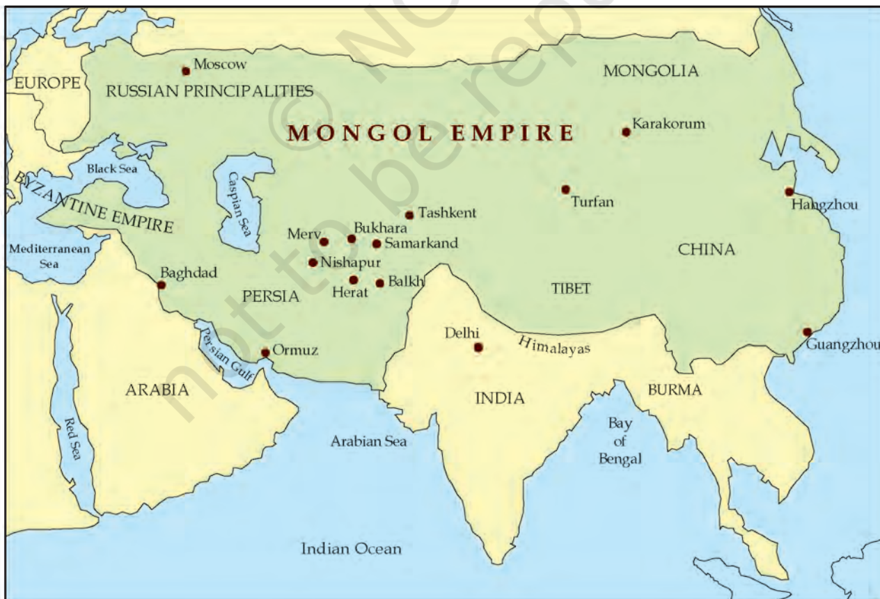
MAP 1: The Mongol Empire

In the early decades of the thirteenth century the great empires of the Euro-Asian continent realised the dangers posed to them by the arrival of a new political power in the steppes of Central Asia: Genghis Khan (d. 1227) had united the Mongol people. Genghis Khan's political vision, however, went far beyond the creation of a confederacy of Mongol