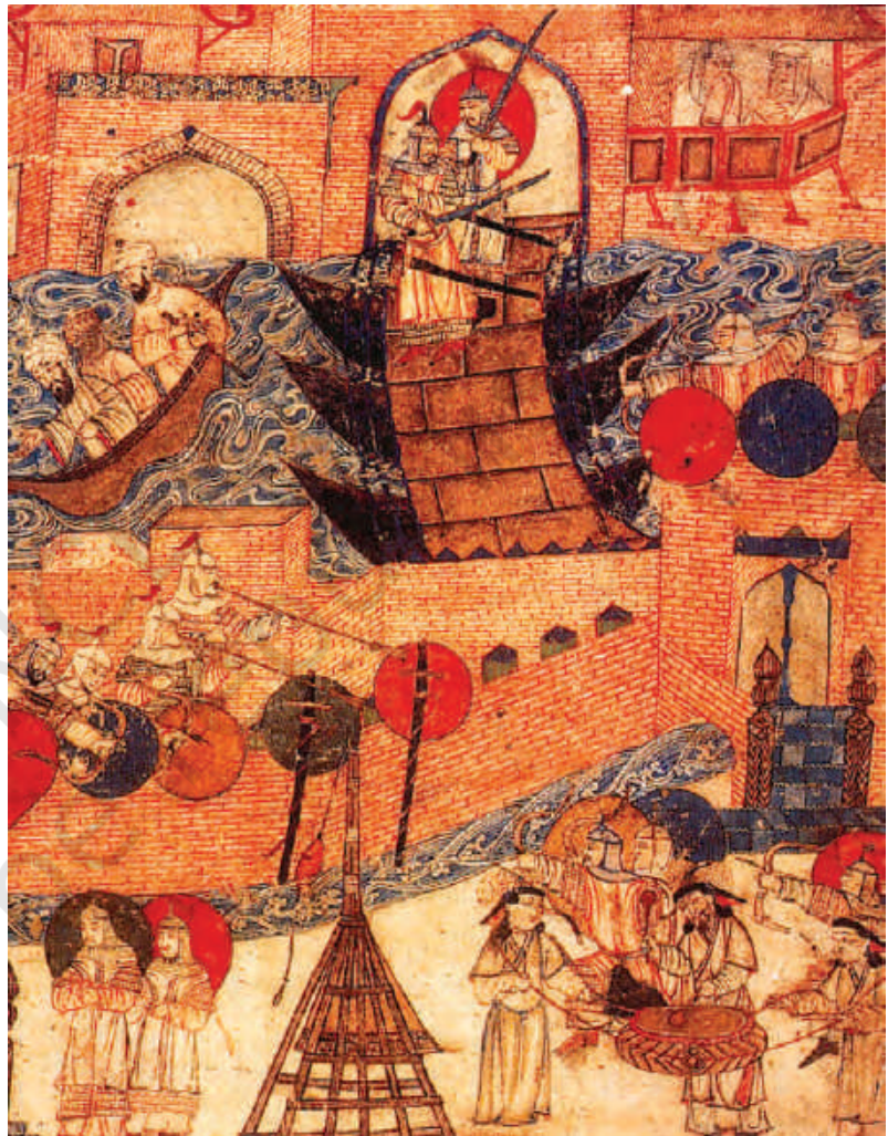
The Capture of Baghdad by the Mongols, a miniature painting in the Chronicles of Rashid al-Din, Tabriz, fourteenth century.

Today, after decades of Soviet control, the country of Mongolia is recreating its identity as an independent nation. It has seized upon Genghis Khan as a great national hero who is publicly venerated and whose achievements are recounted with pride. At a crucial juncture in the history of Mongolia, Genghis Khan has once again appeared as an iconic figure for the Mongol people, mobilising memories of a great past in the forging of national identity that can carry the nation into the future.