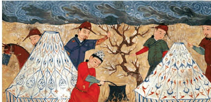
Kubilai Khan and Chabi in camp.