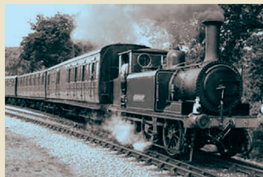
First Train: Bombay(Mumbai) to Thane

The railway line from Bombay to Thane was opened in 1853; from Howrah to Raniganj in 1854-55. The first railway line in south India ran from Madras to Arakonam in 1856. Royapuram was one of the railway stations inaugurated in that year.