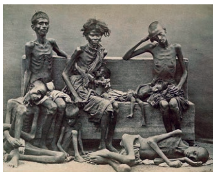
Famine in Madras

In 1815, the Governor of Madras received a communication from the Governor of Ceylon (Sri Lanka) asking for coolies to work on the coffee plantations. The Madras Governor forwarded this letter to the collector of Thanjavur, who after enquiry reported back saying that the people were very much attached to the soil and hence unless some incentive was provided it was not easy to make them move out of their native soil. But the outbreak of two famines (1833 and 1843) forced the people, without any prompting from the government, to leave for Ceylon to work as coolies in coffee and tea plantations under indentured labour system. During 1843-1868, nearly 1.5 million people (1,444,407) had gone from Madras to Ceylon as indentured labourers.