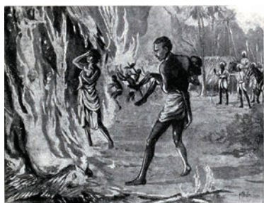
The villagers burning themselves to avoid Pindaris