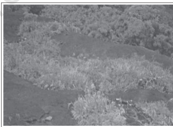
Figure 16.3 : Zenkeria Sebastinei — a critically endangered grass in Agasthiyamalai peak (India)