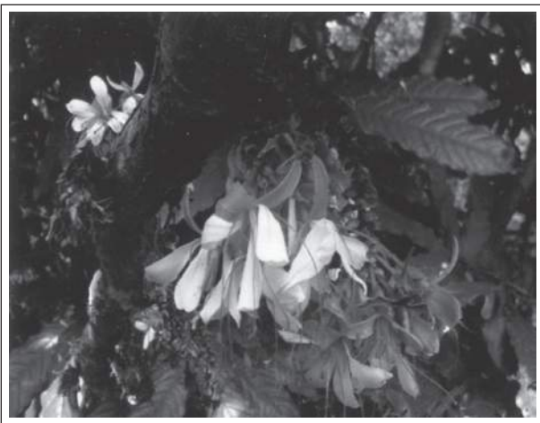
Figure 16.4 : Humboldtia decurrens Bedd — highly rare endemic tree of Southern Western Ghats (India)

Population of these species is very small in the world; they are confined to limited areas or thinly scattered over a wider area.