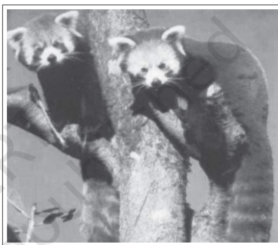
Figure 16.2 : Red Panda — an endangered species

It includes those species which are in danger of extinction. The IUCN publishes information about endangered species world-wide as the Red List of threatened species.