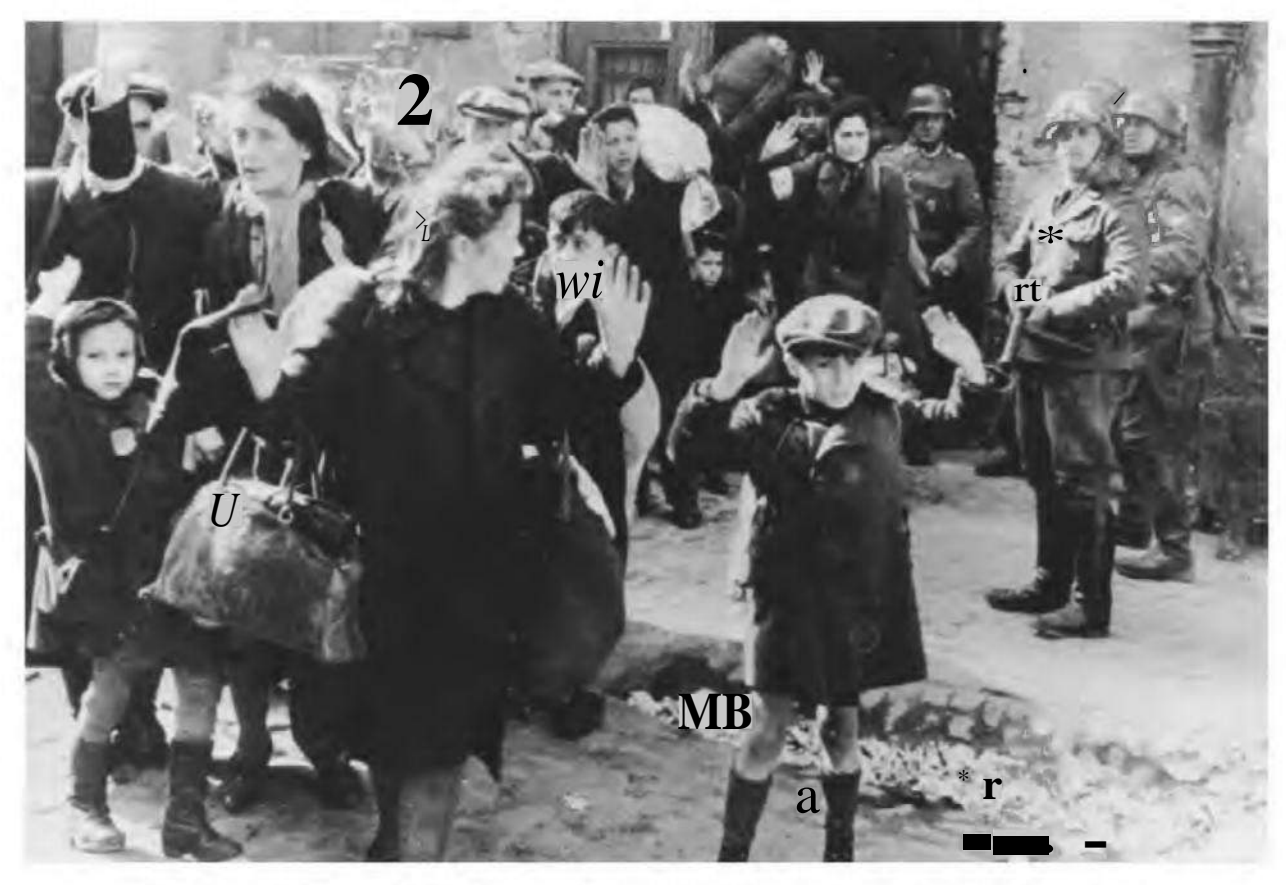
Jl zsrraitei i 1 Jewish people being taxer te « 3 victant atkvi camp

Find the rote on B State fee At First, V.t. State StetMspciiTSi) in tacarre dangering in the state were. StetMspciiTSi) in tacarre my wax The StetMspciiTSi) in tacarre totstiitotrsan state were.