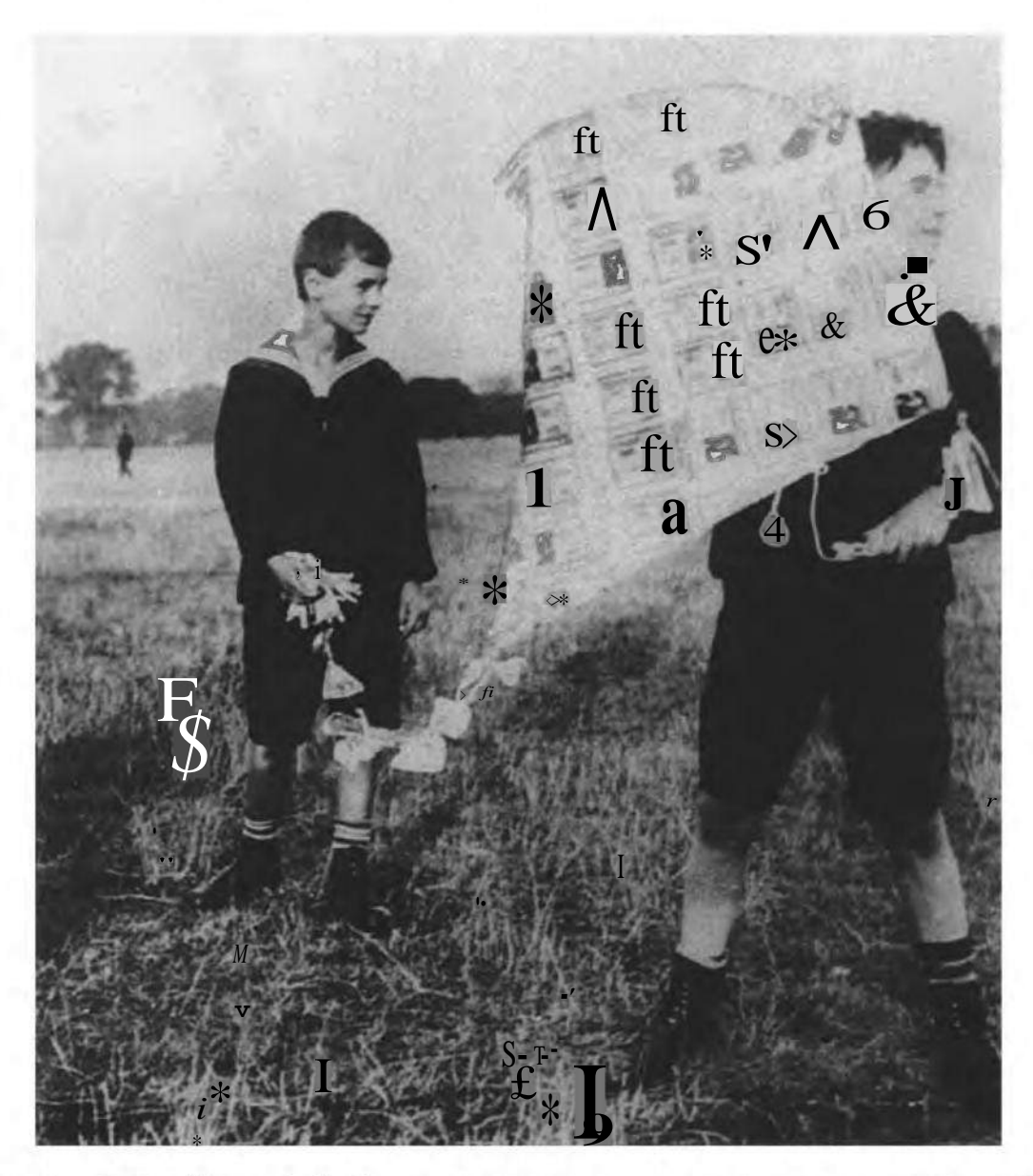
beys rebing kites out of worthless banknotes in the eor) y 192Cs

cdxl they oould sf arsi. The companies with firew Fyn; the Rxfar. Tie, LJJWLVX was wubs izeti, here w m h in six: dx ios us ir; n, xxi cbairitatls and :vyxrx>X erd wexdhy landowsortt and mdnsteiaLists win: Voj:? x dilersSe the rcftjfafx shae if were doing wdleut si m d wy west ven slfw tojay Krirparatism dx u V entr Mjrder the Cawes IF: fdnriin; if the catively it nsasioi: yeans, Ofatssy Sswem im >**? ih dominant palticyZ figure. Alhougfa he was Otaiccdor u.? fr.*m tirdtl Ntivemde* -~/2, he ignared m fotfag refisi= rntil his death October 1.90T raus yrny iddig: r>i spid a steadyiRr rraud