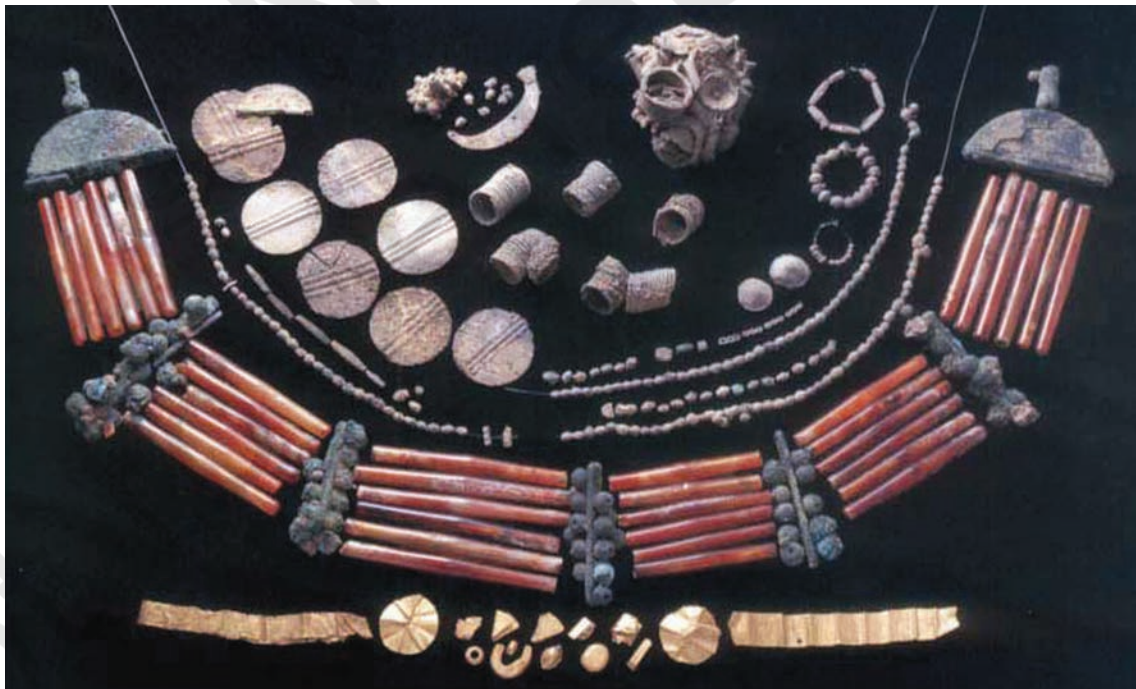
Beadwork and jewellery items

It is evident from the discovery of a large number of spindles and spindle whorls in the houses of the Indus