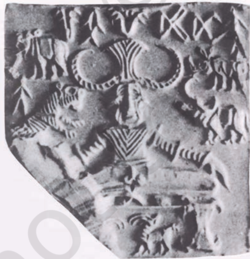
Pashupati seal/female deity

goat and also monsters. Sometimes trees or human figures were also depicted. The most remarkable seal is the one depicted with a figure in the centre and animals around. This seal is generally identified as the Pashupati Seal by some scholars whereas some identify it as the female deity. This seal depicts a human figure seated cross-legged. An elephant and a tiger are depicted to the right side of the seated figure, while on the left a rhinoceros and a buffalo are seen. In addition to these animals two antelopes are shown below the seat. Seals such as these date from between 2500 and 1900 BCE and were found in considerable numbers in sites such as the ancient city of Mohenjodaro in the Indus Valley. Figures and animals are carved in intaglio on their surfaces.