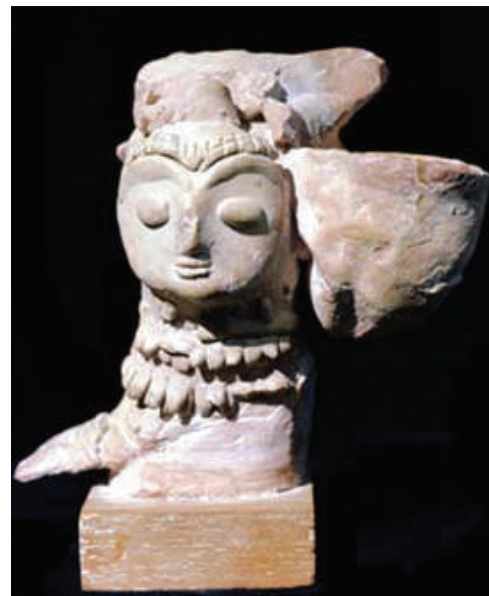
A terracotta figurine