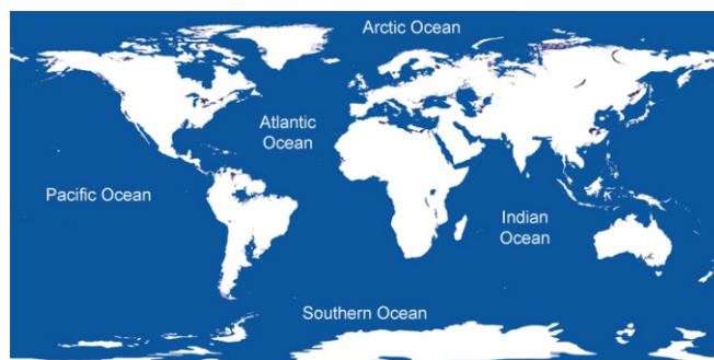
Fig.17.2 : Oceans of the world