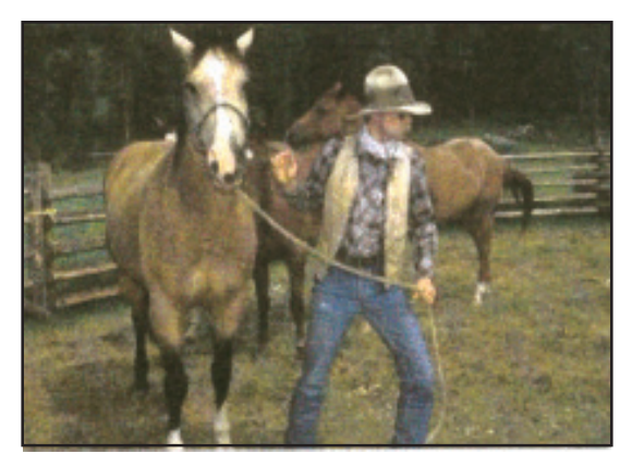
Fig. 9.3: A Cowboy with his horse

sturdy men called cowboys (Fig. 9.3). Bison or the American buffalo is the most important animal of this region (Fig. 9.4). It nearly got extinct due to its indiscriminate hunting and is now a protected species. The other animals found in this region are rabbits, coyotes, gophers and Prairie dog.