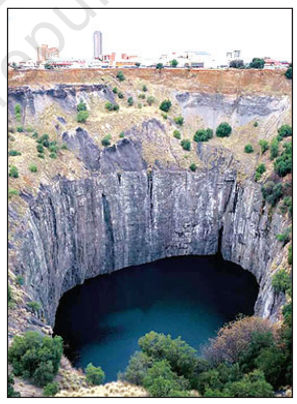
Fig. 9.7: Diamond Mine, Kimberley

The velds have rich reserve of minerals. Iron and steel industry has developed where coal and iron are present. Gold and diamond mining are major occupations of people of this region. Johannesburg is known for being the gold capital of the world. Kimberley is famous for its diamond mines (Fig. 9.7). Mining of diamond and gold in South Africa led to the establishment of trade ties with Britain and gradually South Africa became a British Colony. This mineral rich area has a well-developed network of transport.