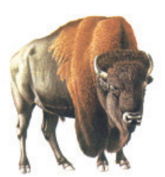
Fig. 9.4: A Bison

Prairies are practically tree-less. Where water is available, trees such as willows, alders and poplars grow. Places that receive rainfall of over 50 cm, are suitable for farming as the soil is fertile. Though the major crop of this area is maize, other crops including potatoes, soybean, cotton and alfa-alfa is also grown. Areas where rainfall is very little or unreliable, grasses are short and sparse. These areas are suitable for cattle rearing. Large cattle farms called ranches are looked after by