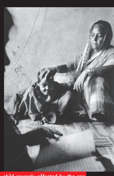
A child severely affected by the gas

Most of those exposed to the poison gas came from poor, working-class families, of which nearly 50,000 people are today too sick to work. Among those who survived, many developed severe respiratory disorders, eye problems and other disorders. Children developed peculiar abnormalities, like the girl in the photo.