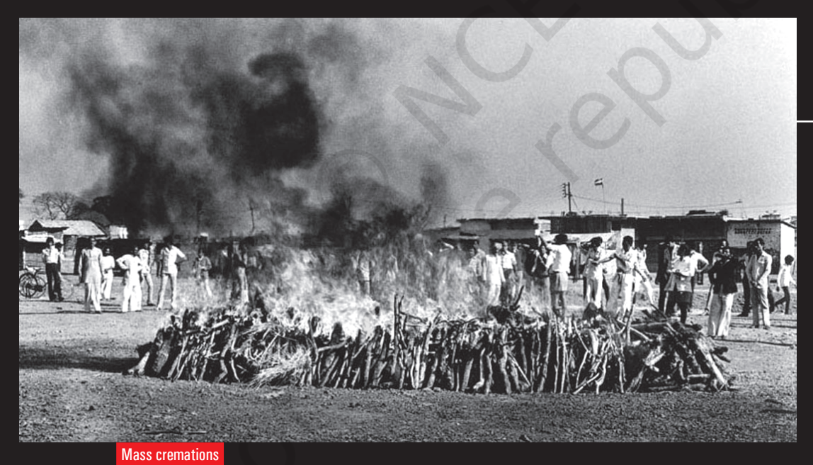
Within three days, more than 8,000 people were dead. Hundreds of thousands were maimed.

Most of those exposed to the poison gas came from poor, working-class families, of which nearly 50,000 people are today too sick to work. Among those who survived, many developed severe respiratory disorders, eye problems and other disorders. Children developed peculiar abnormalities, like the girl in the photo.