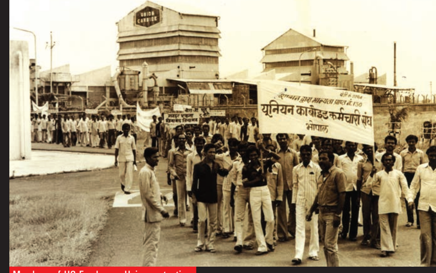
Members of UC Employees Union protesting

The disaster was not an accident. UC had deliberately ignored the essential safety measures in order to cut costs. Much before the Bhopal disaster, there had been incidents of gas leak killing a worker and injuring several.