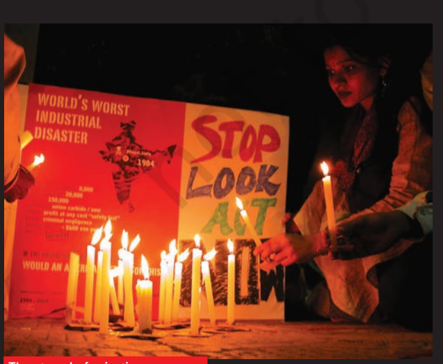
Bags of chemicals lie strewn around the UC plant

UC stopped its operations, but left behind tons of toxic chemicals. These have seeped into the ground, contaminating water. Dow Chemical, the company who now owns the plant, refuses to take responsibility for clean up.