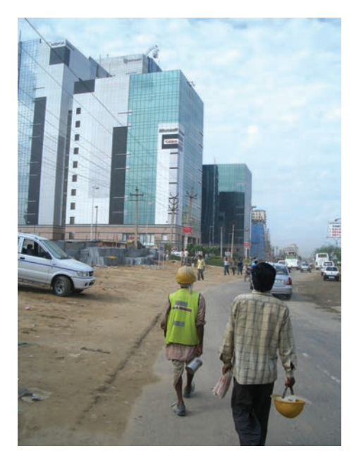
Accidents are common to construction sites. Yet, very often, safety equipment and other precautions are ignored.