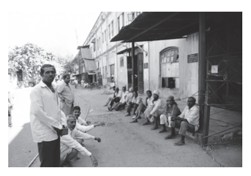
Workers outside closed factories. Thrown out of work, many of the workers end up as small traders or as daily-wage labourers. Some might find work in even smaller production units, where the conditions of work are even more exploitative and the enforcement of laws weaker.

Emissions from vehicles are a major cause of environmental pollution. In a series of rulings (1998 onwards), the Supreme Court had ordered all public transport vehicles using diesel were to switch to Compressed Natural Gas (CNG). As a result of this move, air pollution in cities like Delhi came down considerably. But a recent report by the Center for Science and Environment, New Delhi, shows the presence of high levels of toxic substance in the air. This is due to emissions from cars run on diesel (rather than petrol) and a sharp increase in the number of cars on the road.