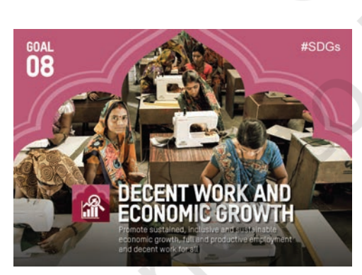
Sustainable Development Goal (SDG) www.in.undp.org

Ship-breaking is another hazardous industry that is growing rapidly in South Asia. Old ships no longer in use, are sent to ship-yards in Bangladesh and India for scrapping. These ships contain potentially dangerous and harmful substances. This photo shows workers breaking down a ship in Alang, Gujarat.