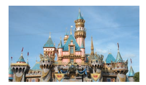
Recently a large travel agency was asked to pay Rs 8 lakh as compensation to a group of tourists. Their foreign trip was poorly managed and they missed Disneyland and shopping in Paris. Why did the victims of Bhopal gas tragedy then get so little for a lifetime of misery and pain?

Can you point to a few other situations where laws (or rules) exist but people do not follow them because of poor enforcement? (For example, over-speeding by motorists, not wearing helmet/seat belt and use of mobile phone while driving). What are the problems in enforcement? Can you suggest some ways in which enforcement can be improved?