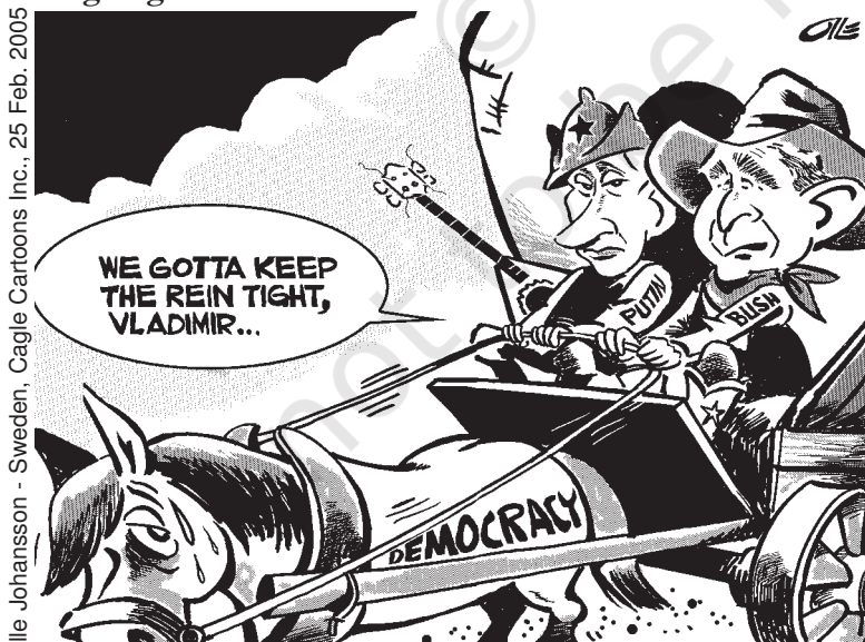
Reigning the Reins