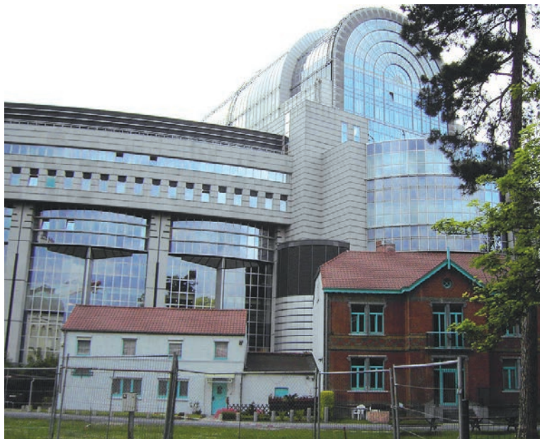
European Union Parliament in Belgium

You might find the Belgian model very complicated. It indeed is very complicated, even for people living in Belgium. But these arrangements have worked well so far. They helped to avoid civic strife between the two major communities and a possible division of the country on linguistic lines. When many countries of Europe came together to form the European