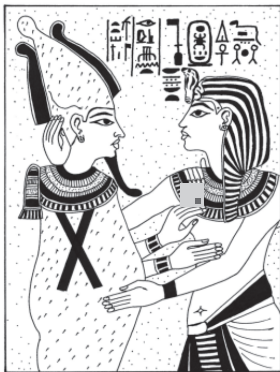
Mural in King Tut's tomb showing King Tut with Osiris, the god of the afterlife

Back in the trailer a technician pulled up astonishing images of Tut on a computer screen. A grey head took shape from a scattering of pixels, and the technician spun and tilted it in every direction. Neck vertebrae appeared as clearly as in an anatomy class. Other images revealed a hand, several views of the rib cage, and a transection of the skull. But for now the pressure was off. Sitting back in his chair, Zahi Hawass smiled, visibly relieved that nothing had gone seriously wrong. "I didn't sleep last night, not for a second," he said. "I was so worried. But now I think I will go and sleep."