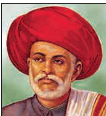
Mahatma Jotirao Phule

From the above views of Mahatma Phule, state the bad effects of Illiteracy.