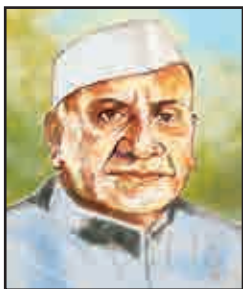
Dr. Panjabrao Deshmukh