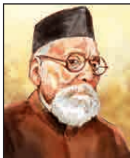
Maharshi Dhondo Keshav Karve