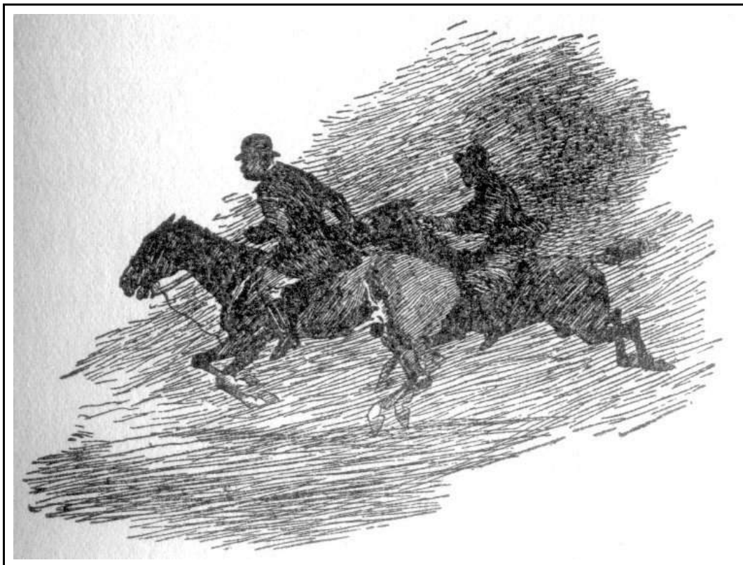
"HE HEARD SOMEBODY GALLOPING AFTER HIM"

look out for a little girl who had been kidnapped by tramps or gipsies. He then ordered his horse to be brought round, and, after insisting on his wife and the three boys sitting down to dinner, rode off down the Ascot road with a groom. He had hardly, however, gone a couple of miles, when he heard somebody galloping after him, and, looking round, saw the little Duke coming up on his pony, with his face very flushed, and no hat. "I'm awfully sorry, Mr. Otis," gasped out the boy, "but I can't eat any dinner as long as Virginia is lost. Please don't be angry with me; if you had let us be engaged last year, there would never have been all this trouble. You won't send me back, will you? I can't go! I won't go!"