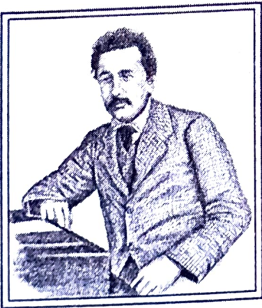
Einstein in 1900 at the age of 21.

liberal : willing to understand and respect others' opinions