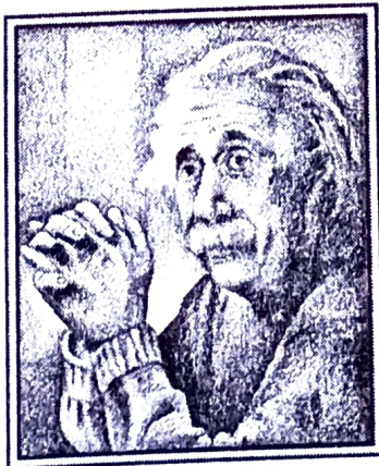
Einstein in 1955 as we remember him now