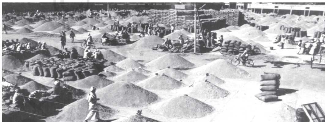
Fig. 6.1 Regulated market yards benefit farmers as well as consumers

Let us discuss four such measures that were initiated to improve the marketing aspect. The first step was regulation of markets to create orderly and transparent marketing conditions. By and large, this policy benefited farmers as well as consumers. However, there is still a need to develop about 27,000 rural periodic markets as regulated market places to realise the full potential of rural markets. Second component is provision of physical infrastructure facilities like roads, railways, warehouses, godowns, cold storages and processing units. The current infrastructure facilities are quite inadequate to meet the growing demand and need to be improved. Cooperative