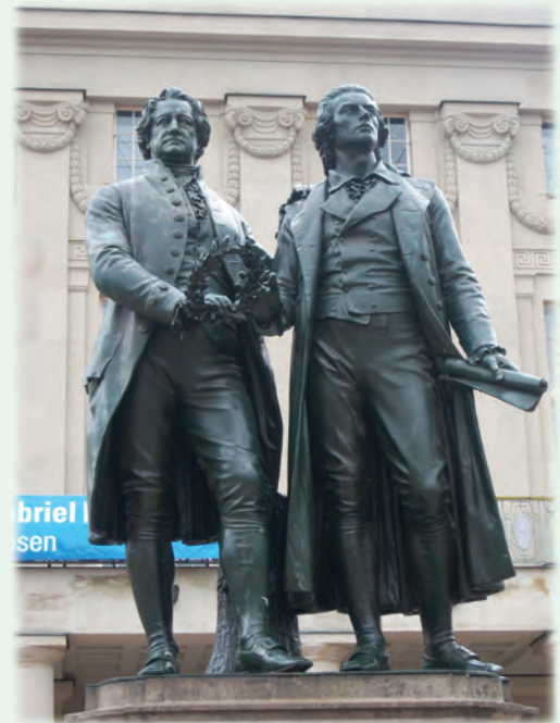
Goethe und Schiller