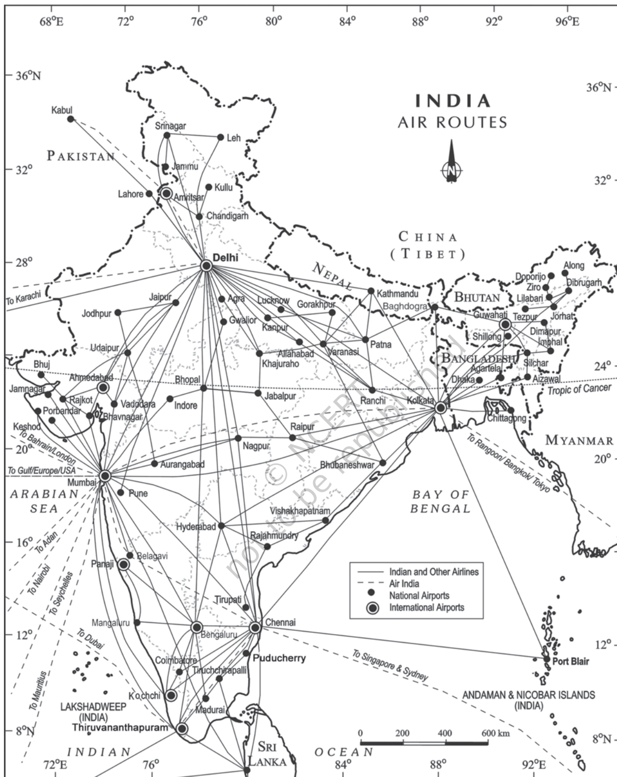
Fig. 11.5 : India – Air Routes