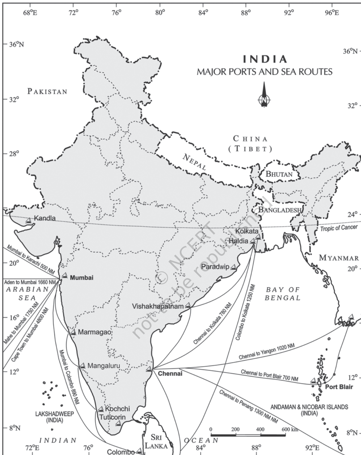
Fig. 11.4 : India – Major Ports and Sea Routes