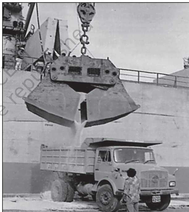
Fig. 11.3 : Unloading of goods on port

India is surrounded by sea from three sides and is bestowed with a long coastline. Water provides a smooth surface for very cheap transport provided there is no turbulence. India