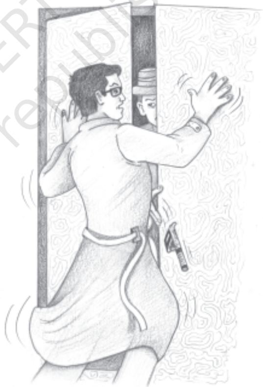
Gerrard gives him a push into the cupboard...

GERRARD : I have got a man posted on the main road. He'll ring up if he sees the