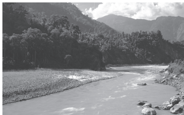
Figure 3.1 : A River in the Mountainous Region

2006) in this class. Can you, then, explain the reason for water flowing from one direction to the other? Why do the rivers originating from the Himalayas in the northern India and the Western Ghats in the southern India flow towards the east and discharge their waters in the Bay of Bengal?