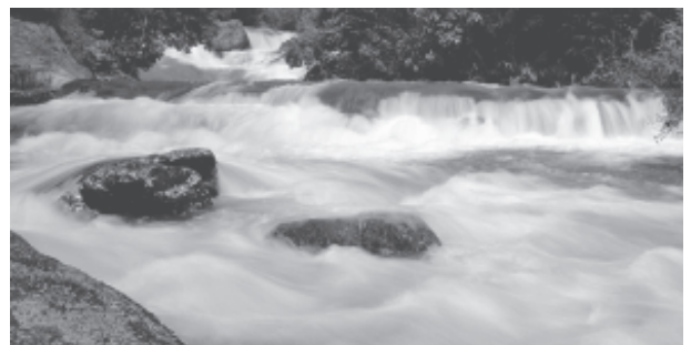
Figure 3.3 : Rapids

The Himalayan drainage system has evolved through a long geological history. It mainly includes the Ganga, the Indus and the Brahmaputra river basins. Since these are fed both by melting of snow and precipitation, rivers of this system are perennial. These rivers pass through the giant gorges carved out by the erosional activity carried on simultaneously with the uplift of the Himalayas. Besides deep gorges, these rivers also form V-shaped valleys, rapids and waterfalls in their mountainous