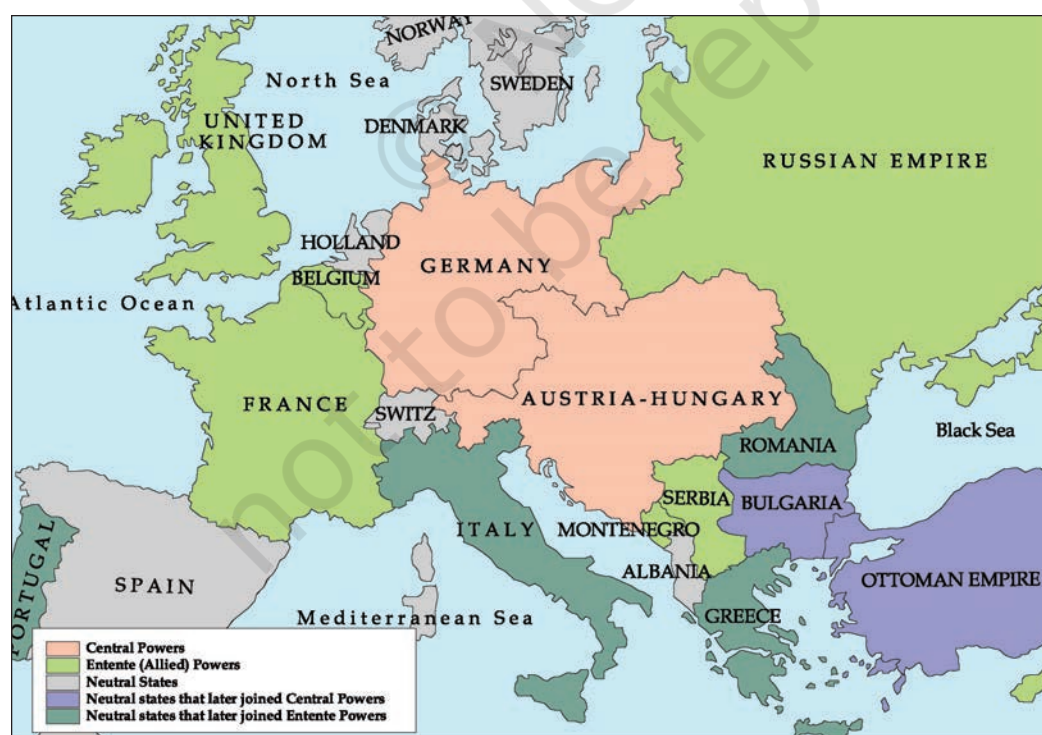
Fig.4 – Europe in 1914.

The map shows the Russian empire and the European countries at war during the First World War.