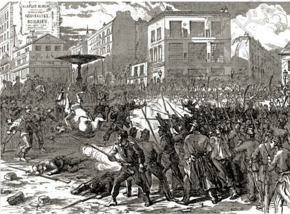
Fig.2 – This is a painting of the Paris Commune of 1871 (From Illustrated London News, 1871). It portrays a scene from the popular uprising in Paris between March and May 1871. This was a period when the town council (commune) of Paris was taken over by a ‘peoples’ government’ consisting of workers, ordinary people, professionals, political activists and others. The uprising emerged against a background of growing discontent against the policies of the French state. The ‘Paris Commune’ was ultimately crushed by government troops but it was celebrated by Socialists the world over as a prelude to a socialist revolution. The Paris Commune is also popularly remembered for two important legacies: one, for its association with the workers’ red flag – that was the flag adopted by the communards ( revolutionaries) in Paris; two, for the ‘Marseillaise’, originally written as a war song in 1792, it became a symbol of the Commune and of the struggle for liberty.