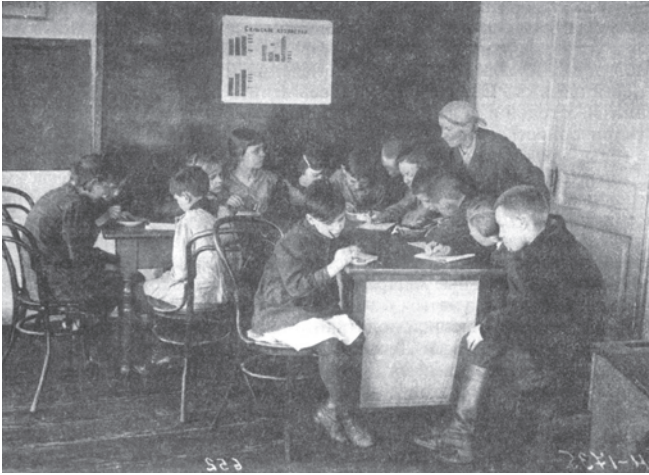
Fig.15 – Children at school in Soviet Russia in the 1930s. They are studying the Soviet economy.