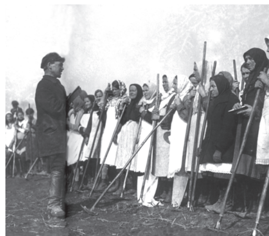
Fig. 19 – Peasant women being gathered to work in the large collective farms.