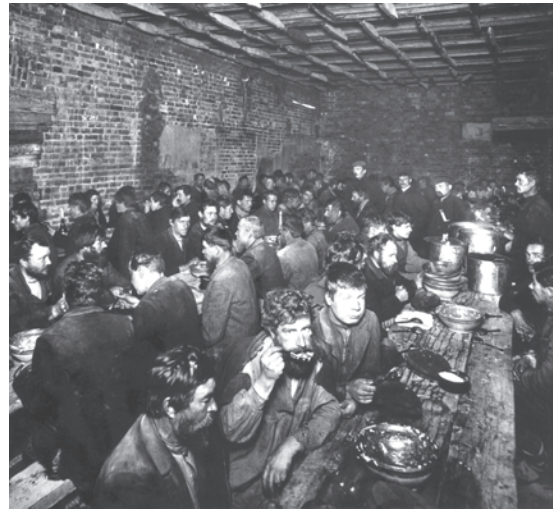
Fig.5 – Unemployed peasants in pre-war St Petersburg.

In the countryside, peasants cultivated most of the land. But the nobility, the crown and the Orthodox Church owned large properties. Like workers, peasants too were divided. They were also