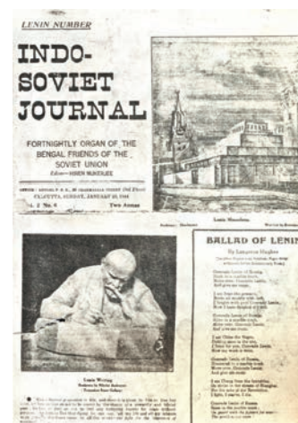
Fig. 20 – Special Issue on Lenin of the Indo-Soviet Journal.