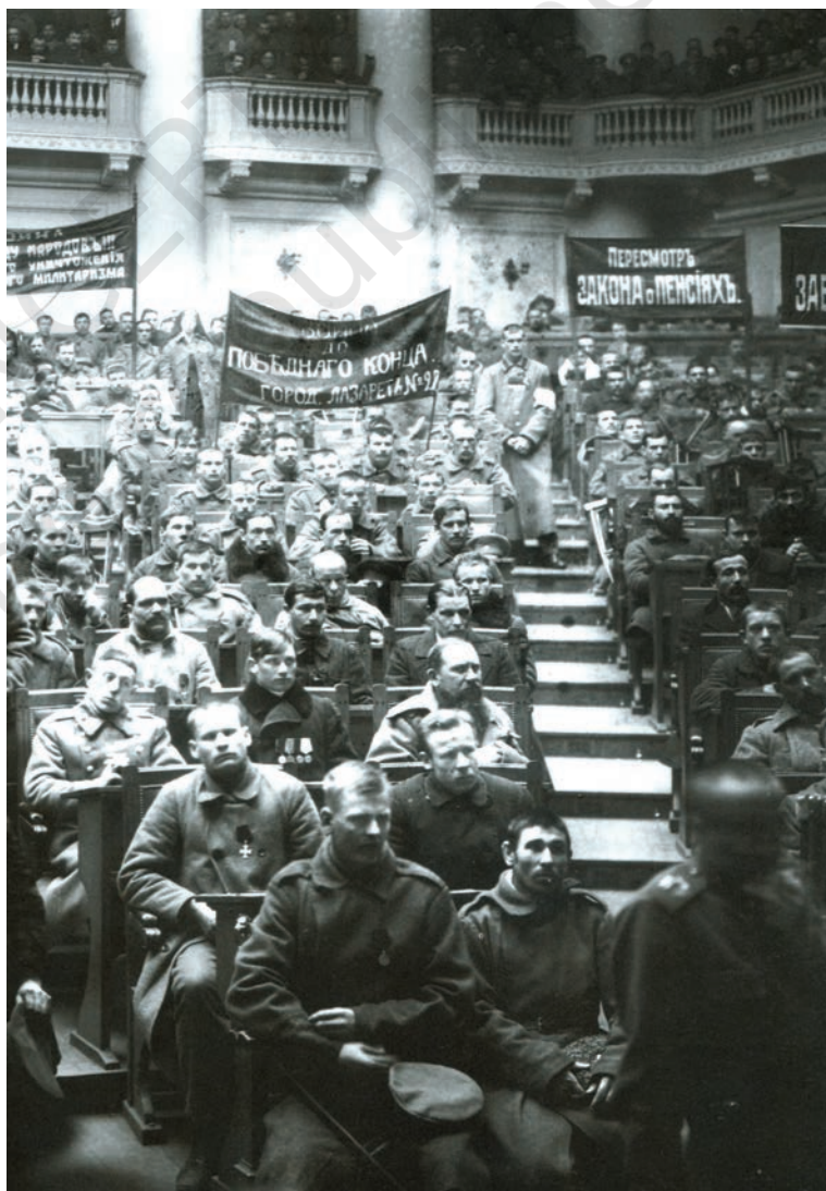
Fig.8 – The Petrograd Soviet meeting in the Duma, February 1917.

On Sunday, 25 February, the government suspended the Duma. Politicians spoke out against the measure. Demonstrators returned in force to the streets of the left bank on the 26th. On the 27th, the Police Headquarters were ransacked. The streets thronged with people raising slogans about bread, wages, better hours and democracy. The government tried to control the situation and called out the cavalry once again. However, the cavalry refused to fire on the demonstrators. An officer was shot at the barracks of a regiment and three other regiments mutinied, voting to join the striking workers. By that evening, soldiers and