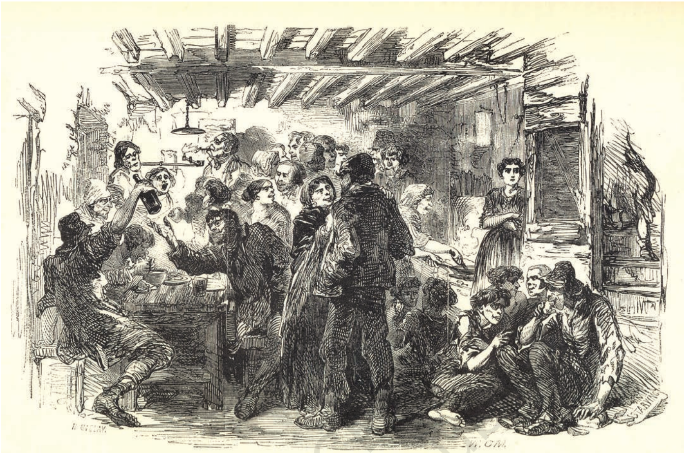
Fig. 1 – The London poor in the mid-nineteenth century as seen by a contemporary.

From: Henry Mayhew, London Labour and the London Poor , 1861.