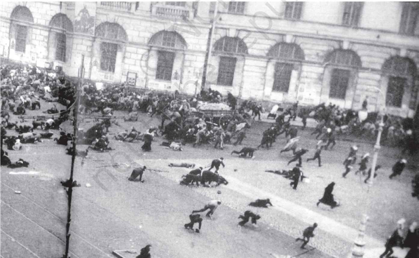
Fig.10 – The July Days. A pro-Bolshevik demonstration on 17 July 1917 being fired upon by the army.