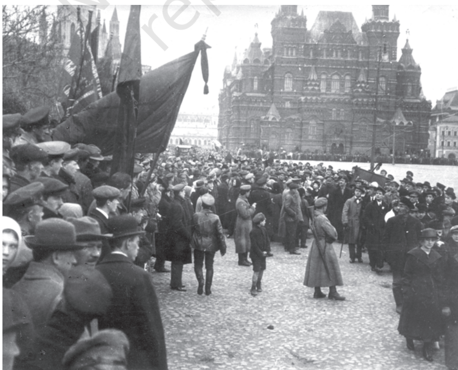
Fig. 13 – May Day demonstration in Moscow in 1918.