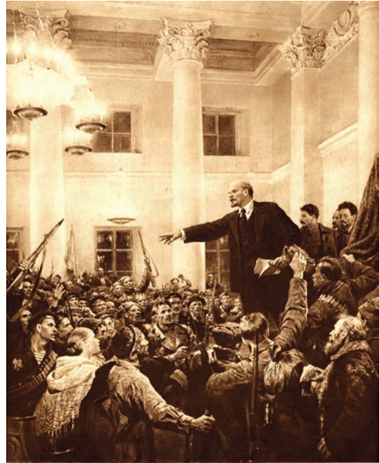
Fig.9 – A Bolshevik image of Lenin addressing workers in April 1917.

Meanwhile in the countryside, peasants and their Socialist Revolutionary leaders pressed for a redistribution of land. Land committees were formed to handle this. Encouraged by the Socialist Revolutionaries, peasants seized land between July and September 1917.