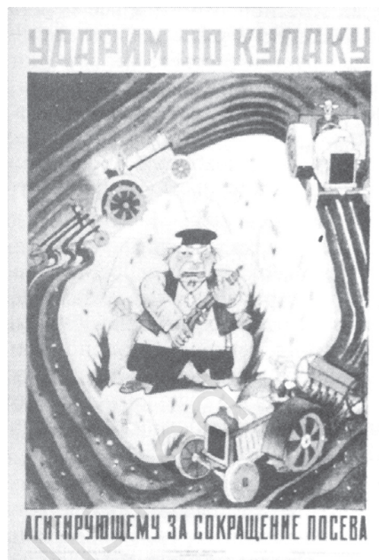
Fig. 18 – A poster during collectivisation. It states: 'We shall strike at the kulak working for the decrease in cultivation.'

Exiled – Forced to live away from one's own country.