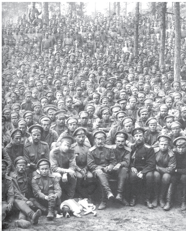
Fig. 7 – Russian soldiers during the First World War.

The war also had a severe impact on industry. Russia's own industries were few in number and the country was cut off from other suppliers of industrial goods by German control of the Baltic Sea. Industrial equipment disintegrated more rapidly in Russia than elsewhere in Europe. By 1916, railway lines began to break down. Able-bodied men were called up to the war. As a result, there were labour shortages and small workshops producing essentials were shut down. Large supplies of grain were sent to feed the army. For the people in the cities, bread and flour became scarce. By the winter of 1916, riots at bread shops were common.