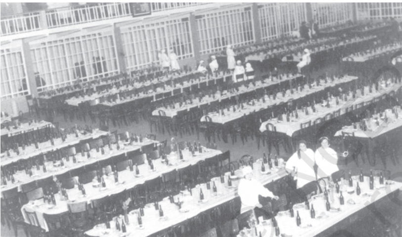
Fig.17 – Factory dining hall in the 1930s.