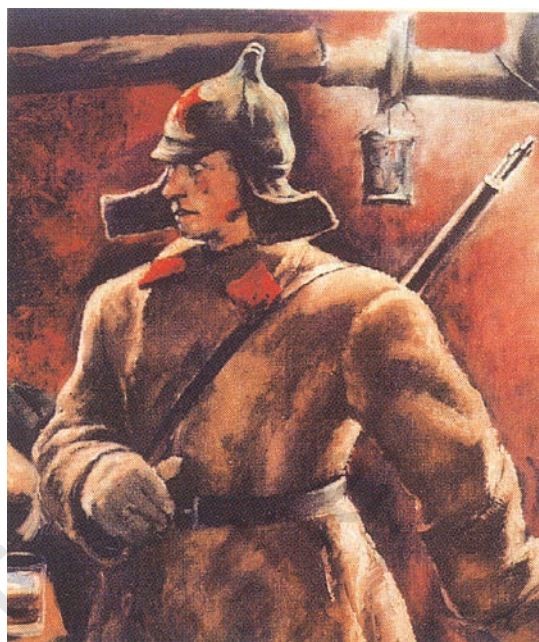
Fig. 12 – A soldier wearing the Soviet hat (budeonovka).

The Bolshevik Party was renamed the Russian Communist Party (Bolshevik). In November 1917, the Bolsheviks conducted the elections to the Constituent Assembly, but they failed to gain majority support. In January 1918, the Assembly rejected Bolshevik measures and Lenin dismissed the Assembly. He thought the All Russian Congress of Soviets was more democratic than an assembly elected in uncertain conditions. In March 1918, despite opposition by their political allies, the Bolsheviks made peace with Germany at Brest Litovsk. In the years that followed, the Bolsheviks became the only party to participate in the elections to the All Russian Congress of Soviets, which became the Parliament of the country. Russia became a one-party state. Trade unions were kept under party control. The secret police (called the Cheka first, and later OGPU and NKVD) punished those who criticised the Bolsheviks. Many young writers and artists rallied to the Party because it stood for socialism and for change. After October 1917, this led to experiments in the arts and architecture. But many became disillusioned because of the censorship the Party encouraged.