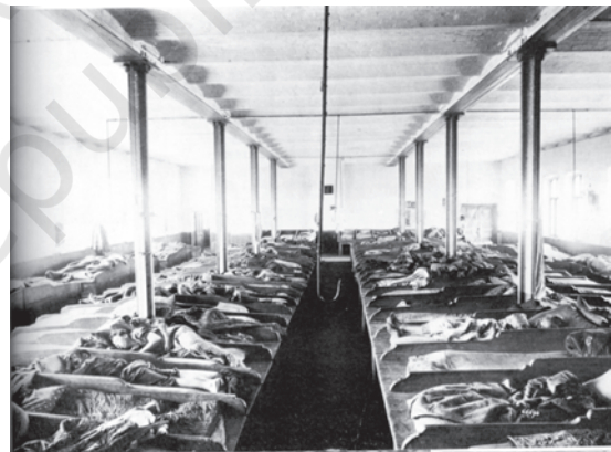
Fig.6 – Workers sleeping in bunkers in a dormitory in pre-revolutionary Russia.

Many survived by eating at charitable kitchens and living in poorhouses.