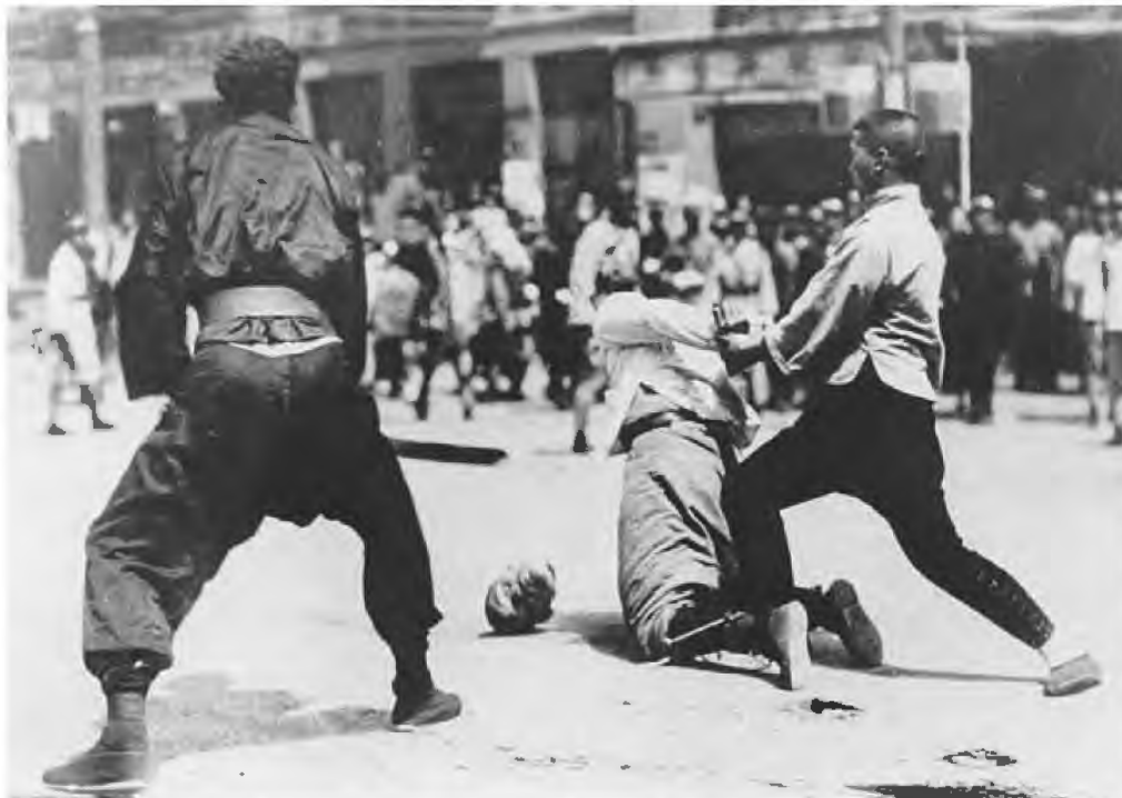
Illustration 19.1 A street execution in China in 1927, towards the end of the Warlord Era

and for the strict upbringing of children. 'Let the ruler be a ruler, the subject a subject, the father a father, and a son a son.' If people acted properly according to their place in society, then the moral integrity and social harmony of the nation would be restored. For centuries Chinese emperors and rulers had embraced Confucianism because it justified their autocratic and conservative rule. After the 1911 revolution and May the Fourth 1919, some writers began to produce questioning and challenging works calling for modernization in politics, science and individual rights in place of traditional Confucianism. But the practical effect of these writings was limited; the warlords were totally unmoved by this new thinking, and Chiang's Nationalists suppressed intellectual and political freedom after they had set up their government in Nanjing in the late 1920s. They even promoted Confucianism because of its conservatism and because it was a good means of distinguishing themselves from Mao and the communists. It was not until the student protests of 1989 that the May the Fourth ideas surfaced again (see Section 20.3).