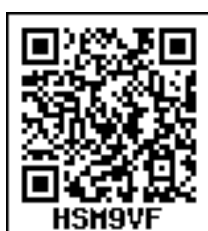
E - Book