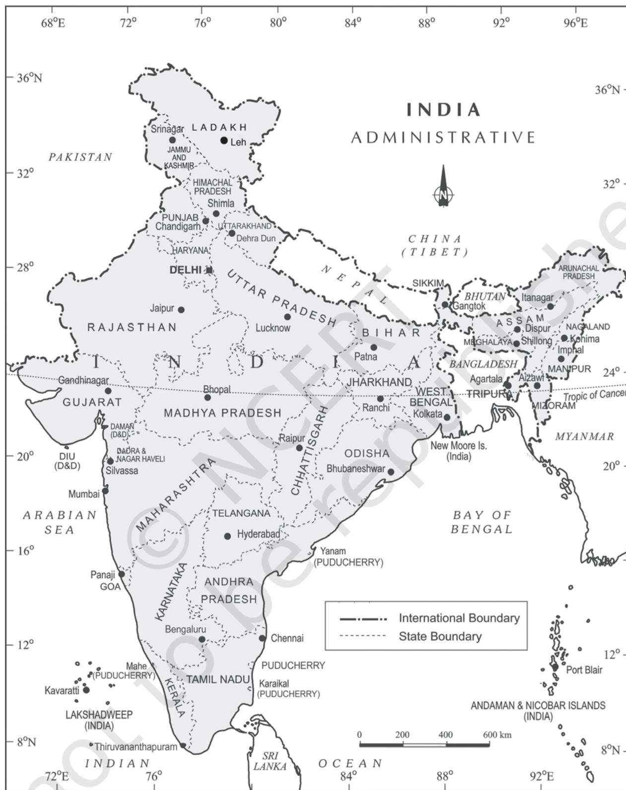
Figure 1.1 : India : Administrative Divisions