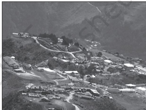
Fig. 4.2 : Semi-clustered settlements

Semi-clustered or fragmented settlements may result from tendency of clustering in a restricted area of dispersed settlement. More often such a pattern may also result from segregation or fragmentation of a large compact village. In this case, one or more sections of the village society choose or is forced to live a little away from the main cluster or village. In such cases, generally, the land-owning and dominant community occupies the central part of the main village, whereas people of lower strata of society and menial workers settle on the outer flanks of the village. Such settlements are widespread in the Gujarat plain and some parts of Rajasthan.