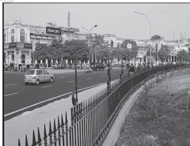
Fig. 4.4 : A view of the modern city

The British and other Europeans have developed a number of towns in India. Starting their foothold on coastal locations, they first developed some trading ports such as Surat, Daman, Goa, Pondicherry, etc. The British later consolidated their hold around three principal nodes – Mumbai (Bombay), Chennai (Madras), and Kolkata (Calcutta) – and built them in the British style. Rapidly