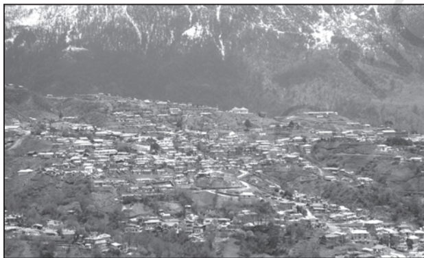
Fig. 4.1 : Clustered Settlements in the North-eastern states

The clustered rural settlement is a compact or closely built up area of houses. In this type of village the general living area is distinct and separated from the surrounding farms, barns and pastures. The closely built-up area and its