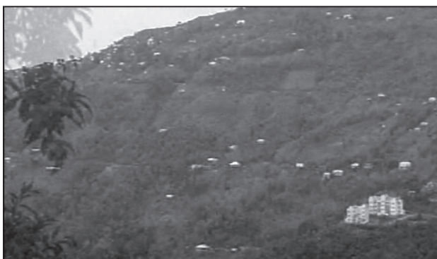
Fig. 4.3 : Dispersed settlements in Nagaland

with farms or pasture on the slopes. Extreme dispersion of settlement is often caused by extremely fragmented nature of the terrain and land resource base of habitable areas. Many areas of Meghalaya, Uttarakhand, Himachal Pradesh and Kerala have this type of settlement.