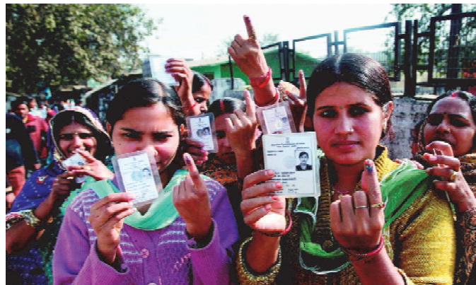
Figure 15.2: Women outside a polling booth after casting their votes. Note their voter's identity cards and the indelible ink mark on their index finger

To sum up, we can say that around 60 percent of the people in our country cast their votes in the general elections, with the participation of women being lower than men. The voting percentage has not increased despite the efforts of the Election Commission and other government and non-government organisations to encourage more people to cast their votes. Hence, there has always been a big difference between the number of people who actually cast their votes and the total number of registered voters. Also, people's participation in elections has been uneven, with more people voting in some elections and less people in some other elections.