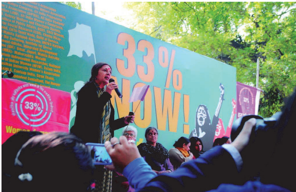
Figure 15.3: A rally demanding 33 percent reservation for women in state assemblies

What do you think are the reasons why political parties have so few women candidates?