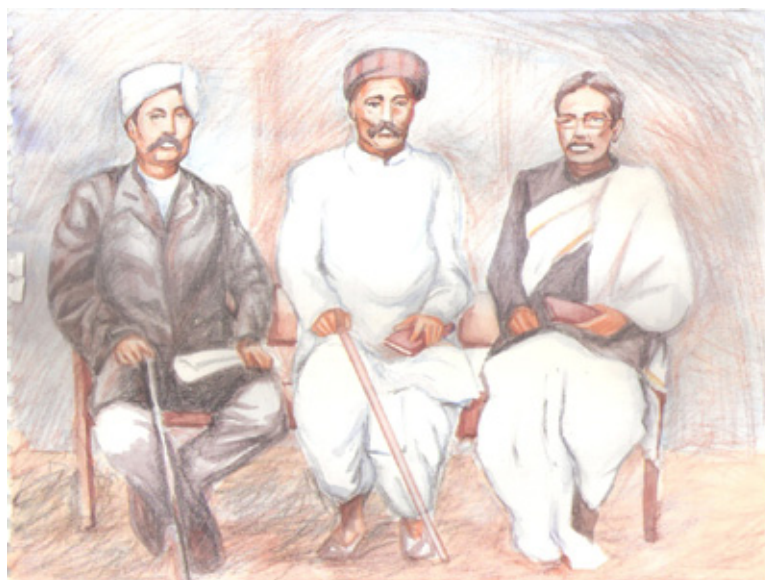
Figure 8.2 Lal-Bal-Pal

The mild policies of the Moderates in the Congress led to the rise of passionate, radical nationalists, who came to be called the 'Garam Dal'. Thus the first phase of the nationalist movement came to an end with government reaction against the Congress on the one hand and a split in the Congress in 1907 on the other. That is why the period after 1905 till 1918 can be referred to as the 'Era of Passionate Nationalists or Garam Dal'. Lala Lajpat Rai, Bal Gangadhar Tilak and Bipin Chandra Pal (Lal-Bal-Pal) were important leaders of this Radical group. When the Moderates were in the forefront of the action, they had maintained a low profile but now they swung into action. Their entry marked the beginning of a new trend and a new face in India's struggle for freedom. According to them, the Moderates had failed to define India's political goals and the methods adopted by them were mild and ineffective. Besides, the Moderates remained confined to the upper, landed class and failed to enlist mass support as a basis for negotiating with the British.