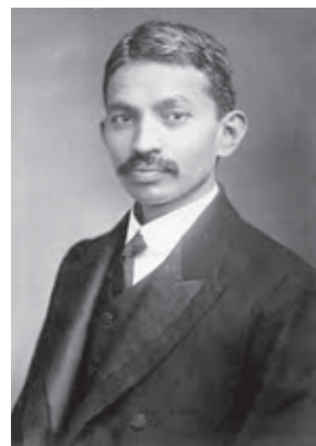
Figure 8.3 Mohan Das Karamchand Gandhi

Mohan Das Karamchand Gandhi was a lawyer, trained in Britain. He went to South Africa in 1893 and resided there for twenty one years. The treatment of the Indians in South Africa by the British provoked his conscience. He decided to fight against the policy of racial discrimination of the South African Government. During the course of his struggle against the government he evolved the technique of Satyagraha (non-violent insistence for truth and justice). Gandhi succeeded in this struggle in South Africa. He returned to India in 1915. In 1916, he founded the Sabarmati Ashram at Ahmedabad to practice the ideas of truth and non-violence. Gopal Krishna Gokhale advised him to tour the country mainly in the villages to understand the people and their problems. His first experiment in Satyagraha began at Champaran in Bihar in 1917 when he inspired the peasants to struggle against the oppressive plantation system. He also organised a satyagraha to support the peasants of the Kheda districts of Gujarat. These peasants were not able to pay their revenue because of crop failure and epidemics. In Ahmedabad, he organized a movement amongst cotton mill workers.