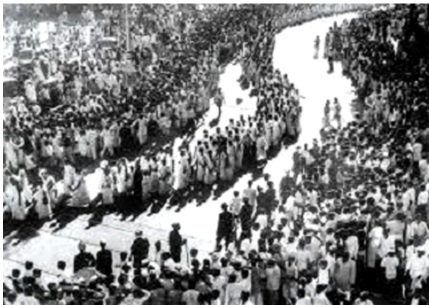
Figure 8.8 Quit India Movement (August, 1942)

movements of historical significance. It demonstrated the depth of national sentiments and indicated the capacity of the Indian people for sacrifice and determined struggle. After this movement there was no retreat. Independence of India was no longer a matter of bargain. It was to be a reality.