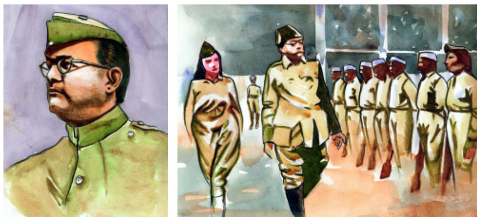
Figure 8.7 Subhash Chandra Bose and Indian National Army

Unfortunately, after that the movement collapsed. What happened to Netaji remains a mystery. It is said that he lost his life in an air crash in August 1945. But it could not be ascertained. The INA continued to occupy an honored place in India's freedom struggle. The intense patriotism of Bose and the soldiers of the INA proved a tremendous source of inspiration for the Indian people.