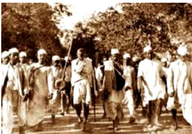
Figure 8.5 Gandhi during Dandi March

Around the same time, the government made a new law. They imposed taxes on the use of salt. This was opposed by the people, as salt was the basic need of the people. But, no attention was paid to demands of the people. During March-April, 1930, Gandhi marched from his Sabarmati Ashram to Dandi on the Gujarat coast for the purpose of raiding the Government Salt. The violation of salt law was his first challenge to the government. It was a peaceful march. Gandhi committed a technical breach of the Salt Law on 6 th April, 1930, when he picked up the scattered sea salt from the coast to break this Law. In this movement farmers, traders and