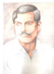
Chandra Shekhar Azad