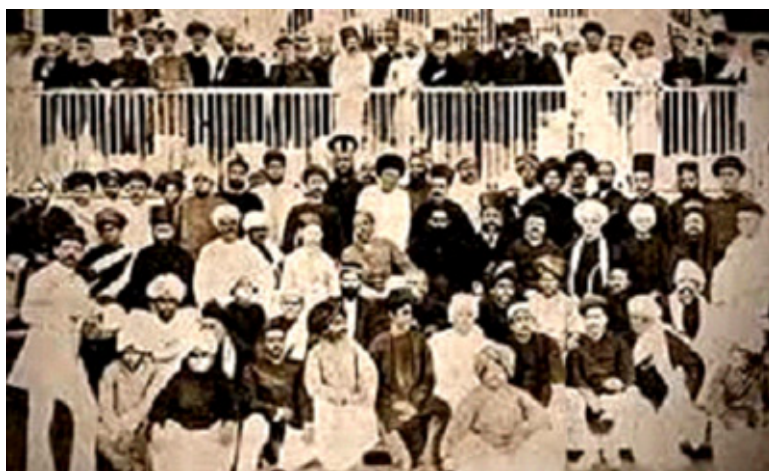
Figure 8.1 Indian National Congress (Session 1885)

The Indian National Congress was founded by Allan Octavian Hume in 1885. Hume was a retired Civil Service Officer. He saw a growing political consciousness among the Indians and wanted to give it a safe, constitutional outlet so that their resentment would not develop into popular agitation against the British rule in India. He was supported in this scheme by the Viceroy, Lord Dufferin, and by a group of eminent Indians. Womesh Chandra Banerjee of Calcutta was elected as the first President. The Indian National Congress represented an urge of the politically conscious Indians to set up a national organization to work for their betterment. Its leaders had complete faith in the British Government and in its sense of justice. They believed that if they would place their grievances before the government reasonably, the British would certainly try to rectify them. Among the liberal leaders, the most prominent were Firoz Shah Mehta, Gopal Krishna Gokhale, Dada Bhai Naoroji, Ras Behari Bose, Badruddin Tayabji, etc. From 1885 to 1905, the Indian National Congress had a very narrow social base. Its influence was confined to the urban educated Indians.