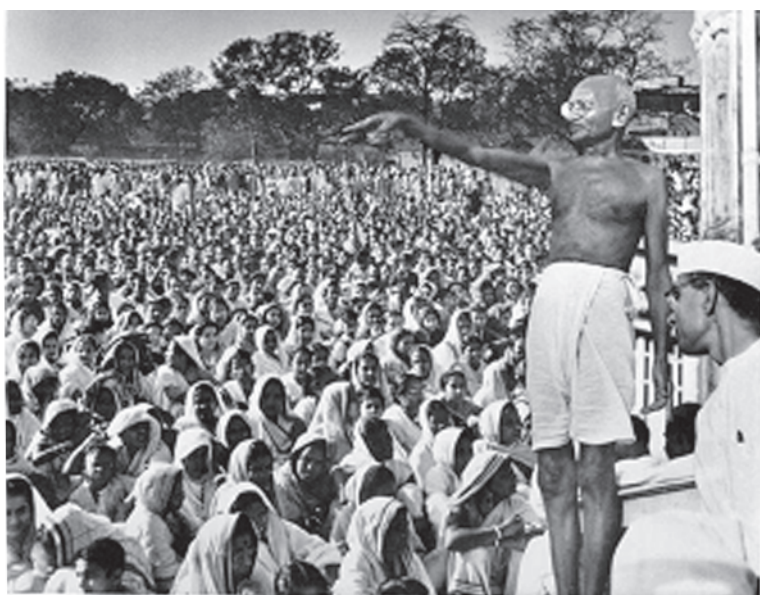
Figure 8.4 Gandhi during National Movement