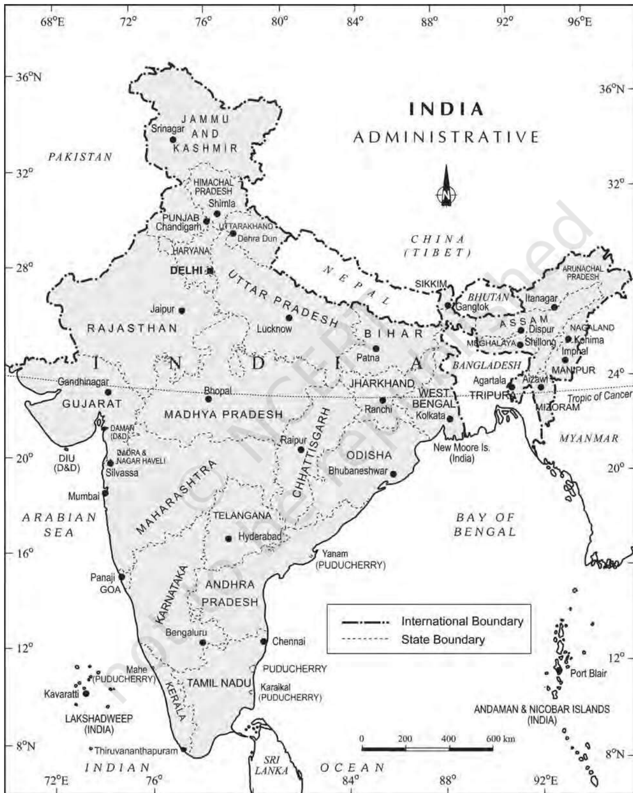
Figure 1.1 : India : Administrative Divisions

Note: Telangana became the 29 th state of India in June 2014.