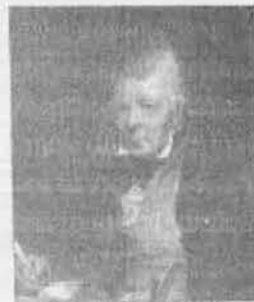
Sir Walter Scott