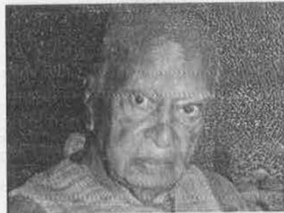
Mulk Raj Anand

The Indian novel in English is part of the Indian literature. It reflects the social, political and cultural ambience of the time. Bankim Chandra's Raj Mohan's Wife written in 1864 was the first Indian novel in English. He wrote profusely in Bengali and awakened national consciousness through his novels. The 30s saw the Indian movement for freedom under Mahatma Gandhi. The three great novelists of the time represented the three aspects of Indian life. Mulk Raj Anand wrote social novels and tried to break the barriers of caste and creed. His untouchable is an attempt to abolish the evil of untouchability. Economic slavery and colonial exploitation are the subject matter of Coolie and Two Leaves and a Bud . R.K. Narayan through his social comedies has mirrored the little ironies of domestic life and crumbling old values in the developing society. Raja Rao has championed the case of Indian Philosophy on the one hand and the essence of Gandhism on the other. The Guide of R. K. Narayan and the Serpent and the Rope and Kanthapura of Raja Rao are immortal works. As the novel consolidated some more novelists joined the band wagon and wrote