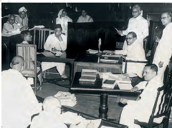
Dr. B.R. Ambedkar presiding over a discussion in the Constituent Assembly

Dr. B.R. Ambedkar CAD, Vol. VII, p.37, 4 November 1948