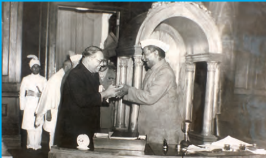
The President of the Constituent Assembly, Dr. Rajendra Prasad and the Chairman of the Drafting Committee, Dr. B.R. Ambedkar greeting each other

Constituent Assembly, where each clause of the Constitution was subjected to scrutiny and debate, is a tribute to public reason at its best. These debates deserved to be memorialised as one of the most significant chapters in the history of constitution making, equal in importance to the French and American revolutions.