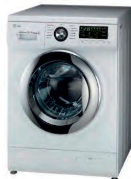
Picture. No. 7.7 Fully-automatic Washing Machine