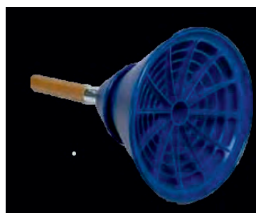
Picture. No. 7.5 Suction Washer