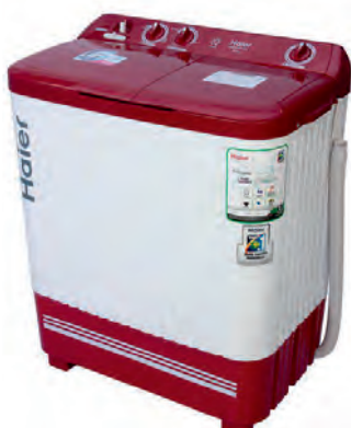
Picture. No. 7.6 Semi-automatic Washing Machine