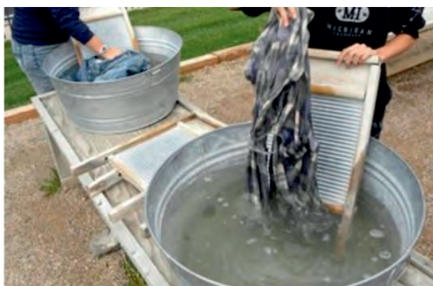
Picture. No. 7.3 Scrubbing Board