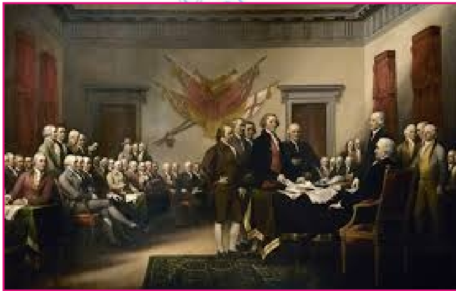
Announcement of American Independence