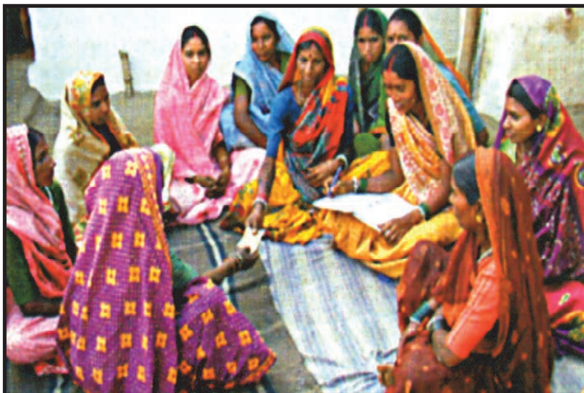
Pic. 8.4 Meeting of self help group

Mother - Sometime ago we formed a co-operative society and then sold our goods. This way we earned more profit than before.