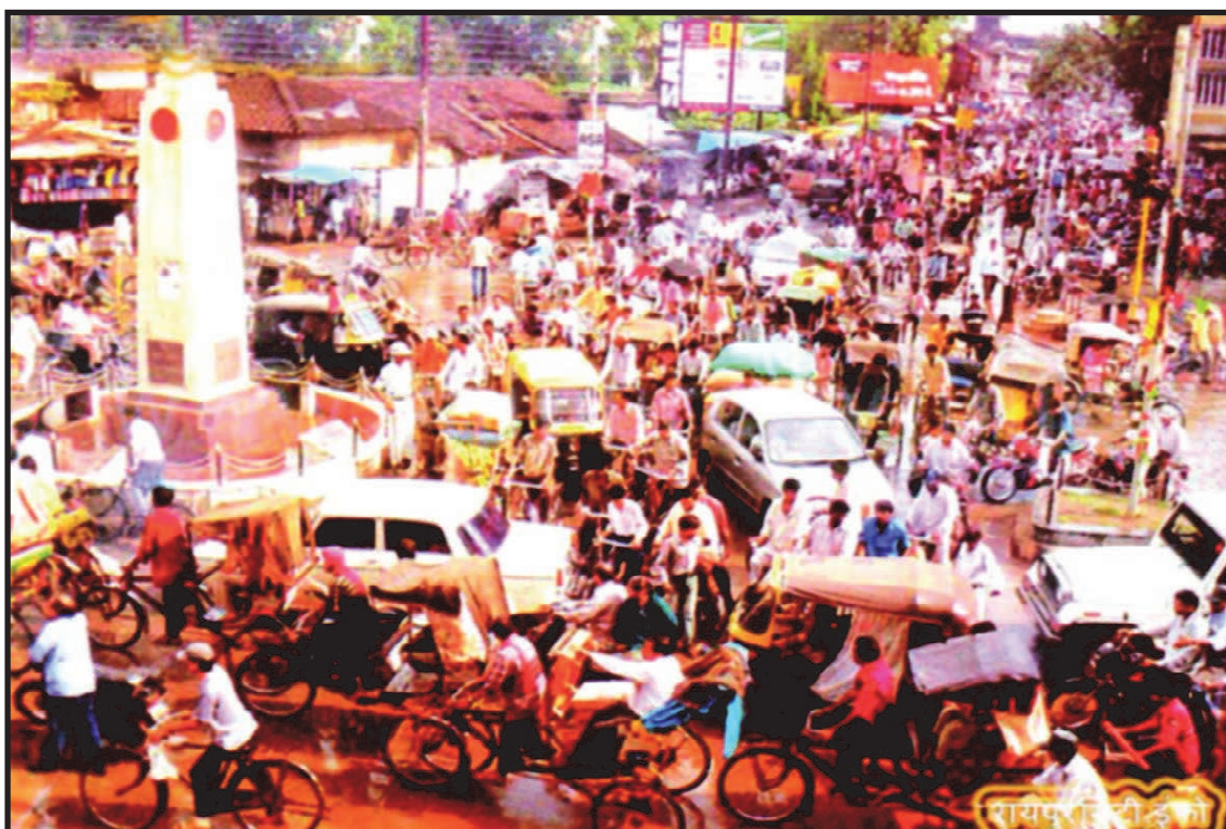
Pic. 8.1 Crowded square

'Better Late Than Never', 'Walk on the left', 'Someone is waiting for you at home,' 'Limited Speed, Safe life', 'Traffic is yours, Safety is yours'. Have you ever been to the busiest road of your city or market? You must have seen that to reach certain places one has to wait for a long time in the crowd - there is a lot of traffic, vehicles are not parked properly, building materials are piled up on the road and stray animals roam on the roads. People drive rashly and take shortcuts even if they are on the wrong side in order to reach early. This can lead to serious accidents.