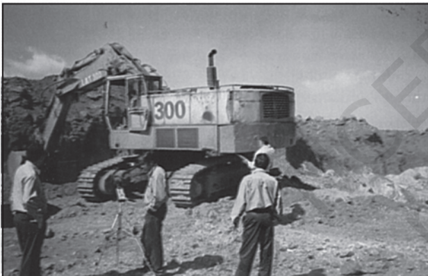
Fig. 12.2 : Noise monitoring at Panchpatmalai Bauxite Mine

The main sources of noise pollution are various factories, mechanised construction and demolition works, automobiles and aircraft, etc. There may be added periodical but polluting noise from sirens, loudspeakers used in various festivals, programmes