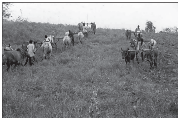
Fig. 12.5 : Community Participation for Land Leveling in Common Property Resources in Jhabua (ASA, 2004)