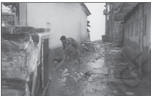
Fig. 12.3 : A view of urban waste in Mahim, Mumbai