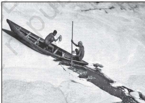
Fig.12.1 : Cutting Through Effluent : Rowing through a pervasive layer of foam on the heavily polluted Yamuna on the outskirts of New Delhi

Indiscriminate use of water by increasing population and industrial expansion has led degradation of the quality of water considerably. Surface water available from rivers, canals, lakes, etc. is never pure. It contains small quantities of suspended particles, organic and inorganic substances. When concentration of these substances increases, the water becomes polluted, and hence becomes unfit for use. In such a situation, the self-purifying capacity of water is unable to purify the water.