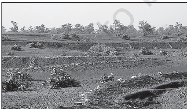
Fig. 12.4 : Trees planted on Common Property Resources in Jhabua

An interesting aspect of this experience is that before the community embarked upon the process of management of the pasture, there was encroachment on this land by a villager from an adjoining village. The villagers called the tehsildar to ascertain the rights of the common land. The ensuing conflict was tackled by the villagers by offering to make the defaulter encroaching on the CPR a member of their user group and sharing the benefits of greening the common lands/pastures. (See the section on CPR in chapter ‘Land Resources and Agriculture’).