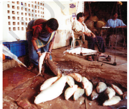
Top: Members of the TMS protesting at a rally. Above: A member of the cooperative weighing the fish.

With the TMS taking over the fishworkers were able to increase their earnings substantially. This was because they set up the cooperative which would buy the catch from them at a fair price. The cooperative would then arrange to transport and sell this in markets where they would get a good price. They have now begun to earn three times more than they earned earlier. The TMS has also begun giving the fishworkers loans for repair and the buying of new nets. By managing to earn a higher wage as well as preserving the fish in the reservoir, the TMS has shown that when people's organisations get their rights to livelihood, they can be good managers.