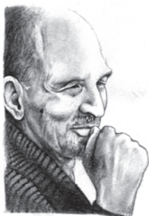
Ingmar Bergman 1918-2007

Ingmar Bergman is a well known Swedish director of films noted for their starkness, their subtle use of black and white and 'shades' of those extremes, the ambiguity of their content, and a certain brooding presence that seems to pervade them all. The list of Bergman films is long; his best known include The Seventh Seal (1957), Wild Strawberries (1958), The Virgin Spring (1960), The Silence (1963), Persona (1967), The Passion of Anna (1970), and Cries and Whispers (1973)—this last film in colour, though emphasising red in all its shadings. In the following selection, the Introduction to Four Screen-plays by Ingmar Bergman (1960), Bergman discusses how he views the art of film-making.