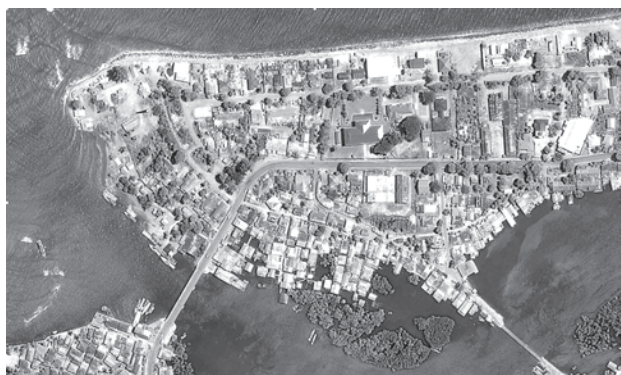
Band Aceh, June, 2004