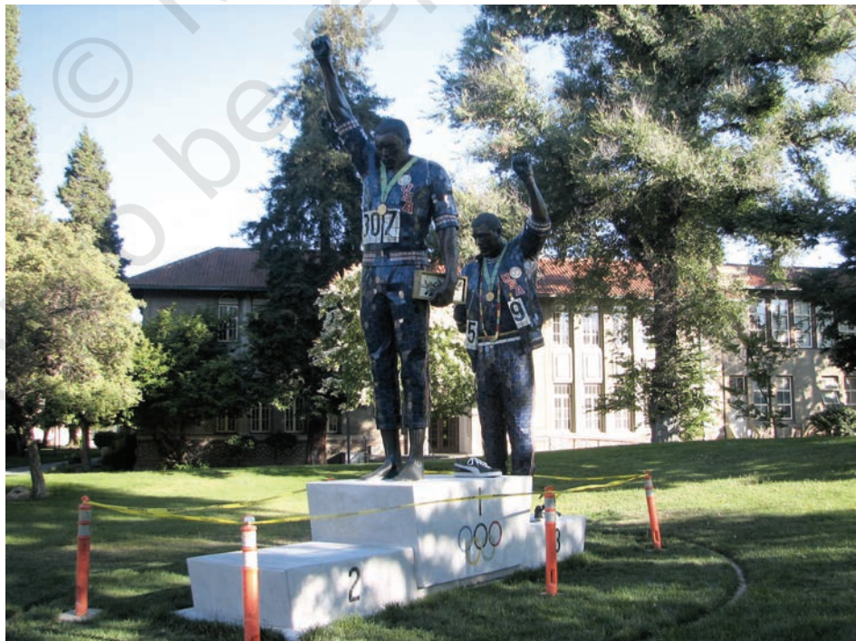
In 2005, the San Jose State University installed a 20-foot high sculpture representing the protest by Tommie Smith and John Carlos. A photograph of the original medal ceremony in 1968 is on the top.

Do you think that Carlos and Smith should have raised an internal matter of American society in an international forum? Would you say that what they did was political? Why do you think Peter Norman, who was neither Black nor American, joined in the gesture of protest? If you were in Norman's place what would you do?